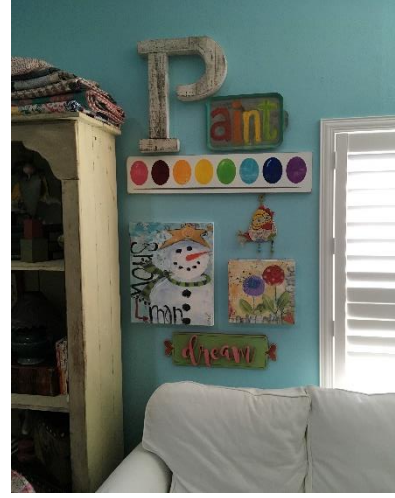
My Turquoise living room wall!

Your questions can always be answered at the Website <a href="www.angelthyme.com">www.angelthyme.com</a>. Check out all the latest patterns and of course view the newsletter.