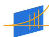
Qvidian Reports & System Settings