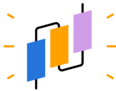
Qvidian Library Basics