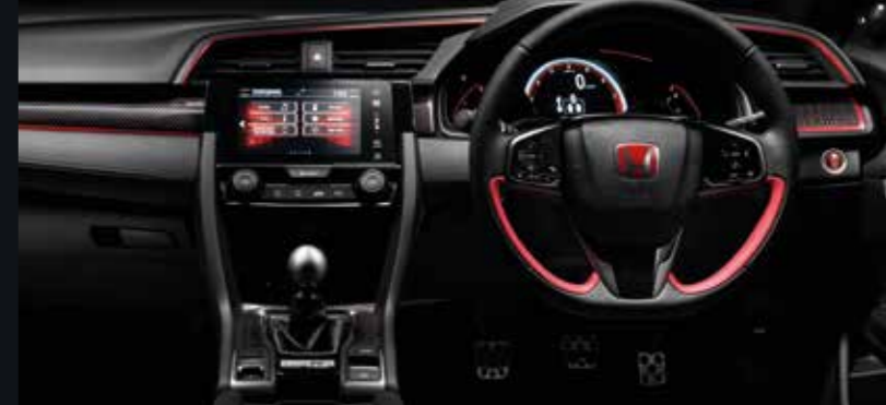
Interior carbon kit