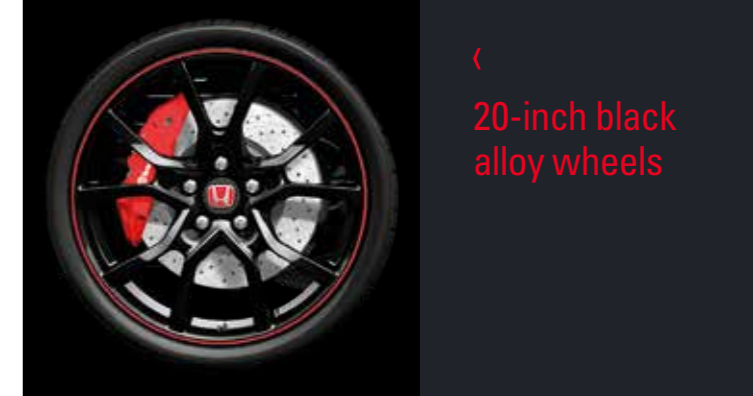
20-inch black alloy wheels