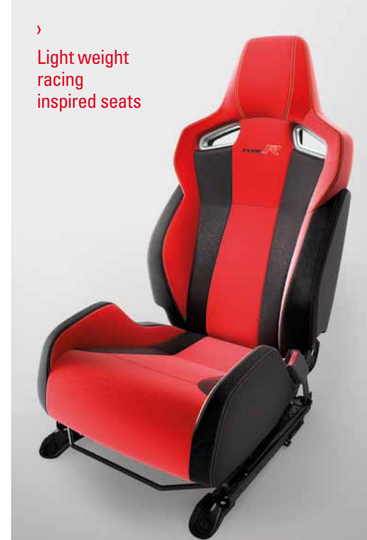
Light weight racing inspired seats