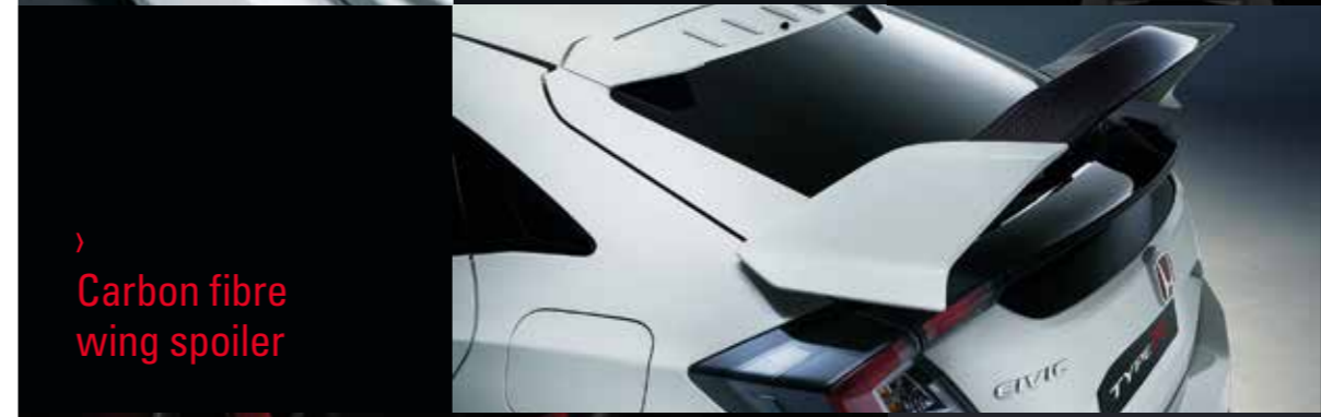
Carbon fibre wing spoiler