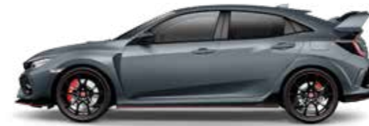
Sonic Grey (Pearlescent)*