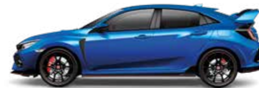
Brilliant Sporty Blue (Metallic)*