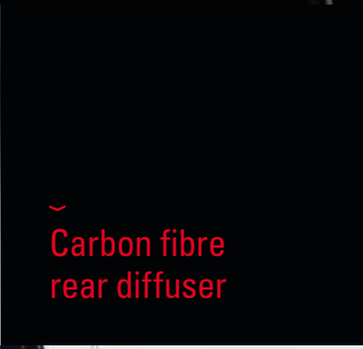
Carbon fibre rear diffuser