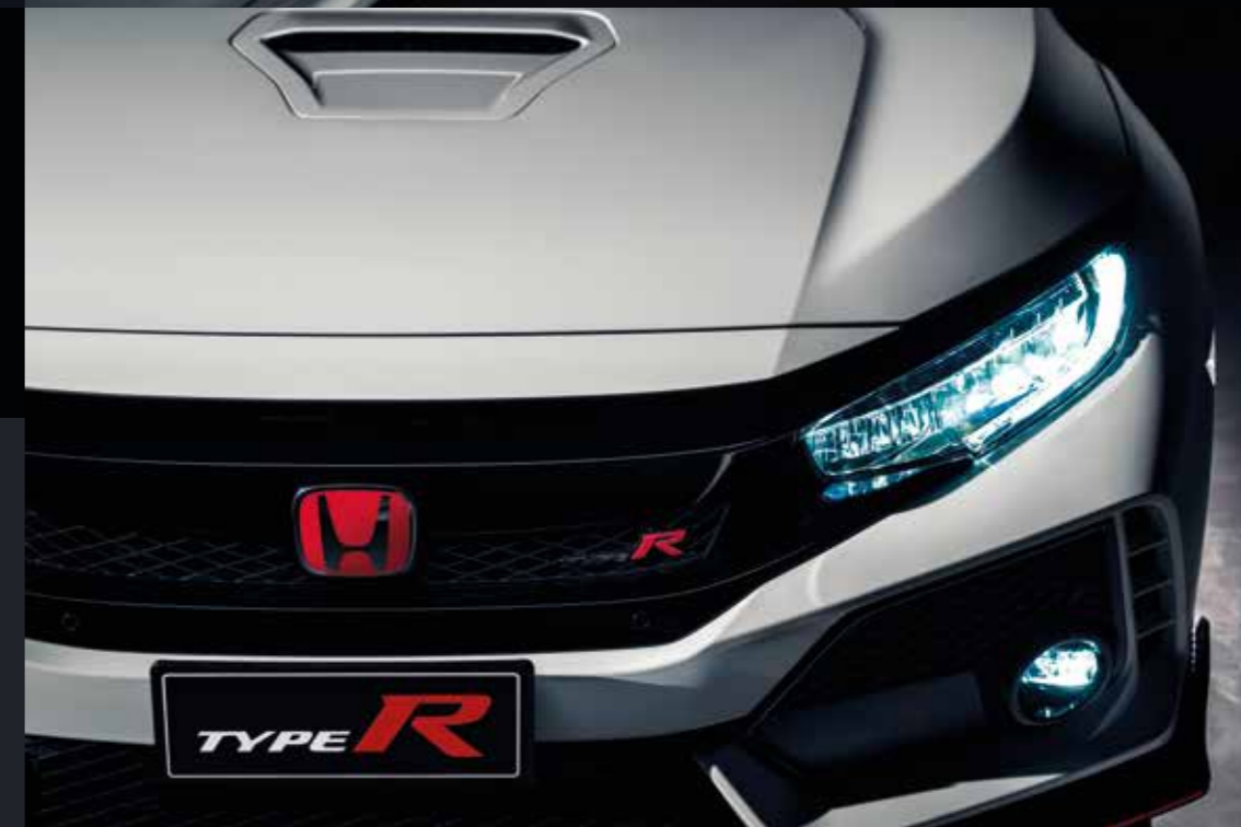
LED headlights and fog lights

At the rear, the signature Type R wing works in conjunction with vortex generator fins on the roof line, diverting air flow over and away from the rear of the car, helping to reduce the overall drag coefficient.