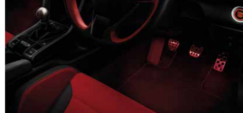
Foot lighting set – red