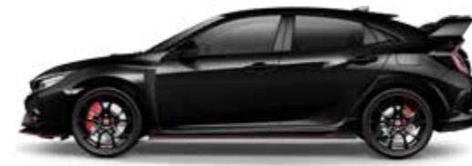
Crystal Black (Pearlescent)*