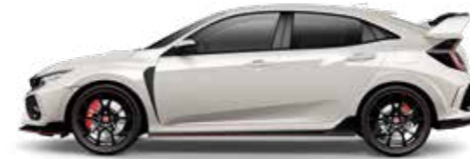
Championship White (Premium)*