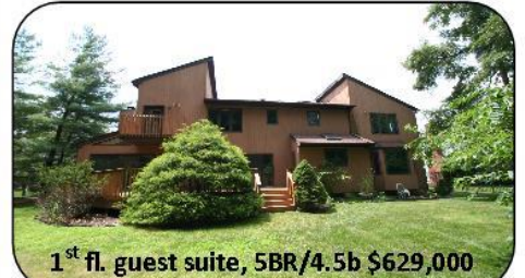
1 st fl. guest suite, 5BR/4.5b $629,000