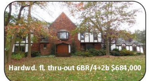
Hardwd. fl. thru-out 6BR/4+2b $684,000