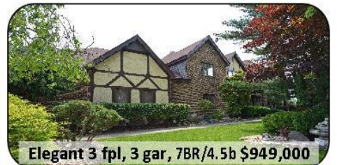
Elegant 3 fpl, 3 gar, 7BR/4.5b $949,000