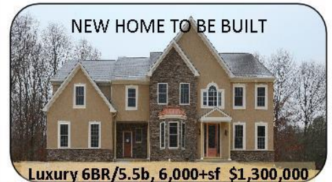
Luxury 6BR/5.5b, 6,000+sf $1,300,000