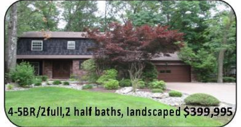
4-5BR/2full, 2 half baths, landscaped $399,995