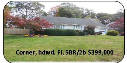
Corner, hdwd. fl, 5BR/2b $399,000