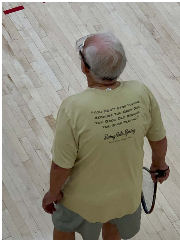
Words to live by...