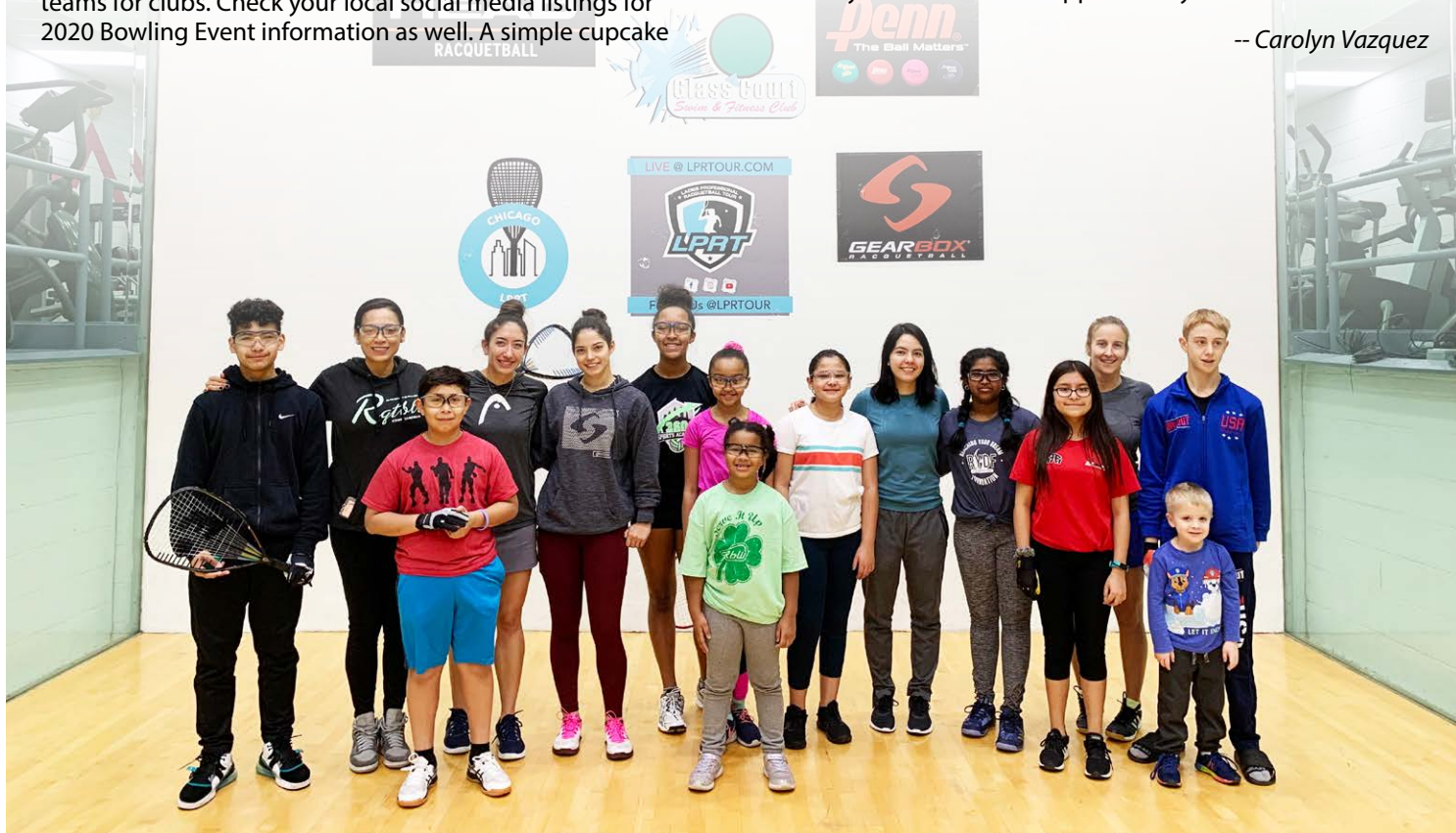
LPRT Pro Players Hosted a Clinic for Juniors from Illinois and Iowa at the Turkey Shoot in November