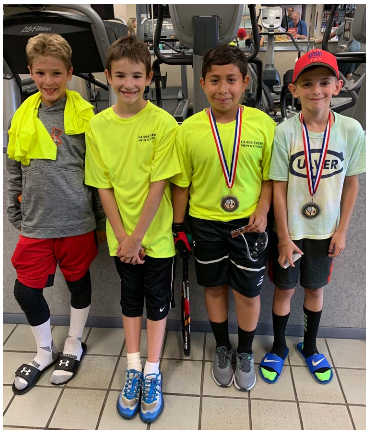
Junior Boys took to the courts!