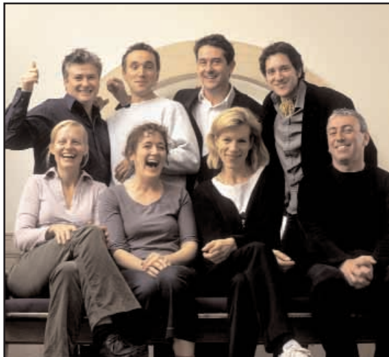
The cast of The Pallisers

Over 12 weeks, Greg Wise, David Troughton and Juliet Stevenson lead BBC Radio 4’s dramatisation of The Palliser novels by Anthony Trollope.