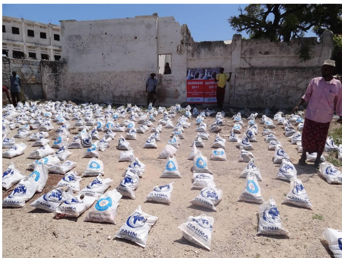
Figure 7 Packed meat is being counted and arranged to make sure transparent and smooth distribution