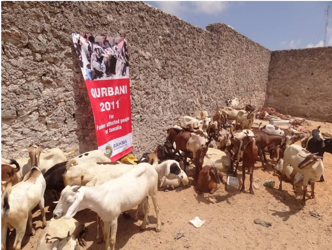
Figure 3 Extra 30 goats before qurbani