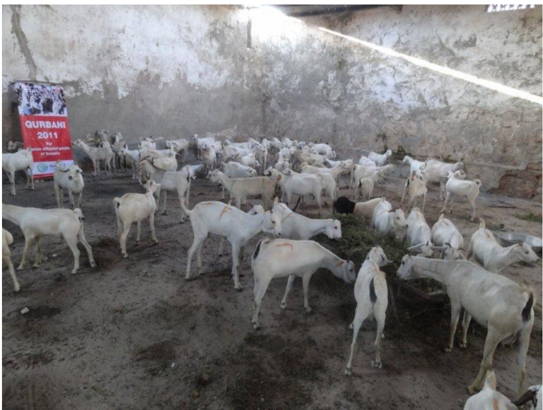
Figure 1 Qurbani animals at warehouse