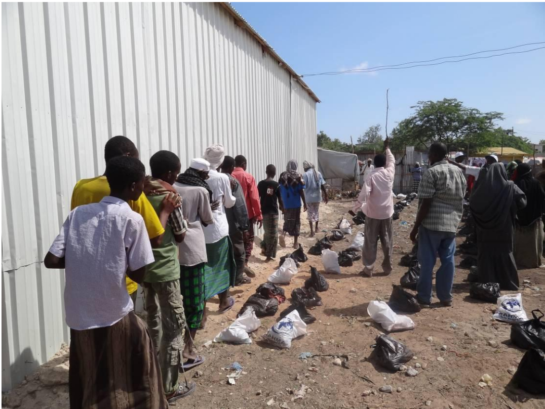
Figure 9 Beneficiaries arriving to collect meat in discipline manner