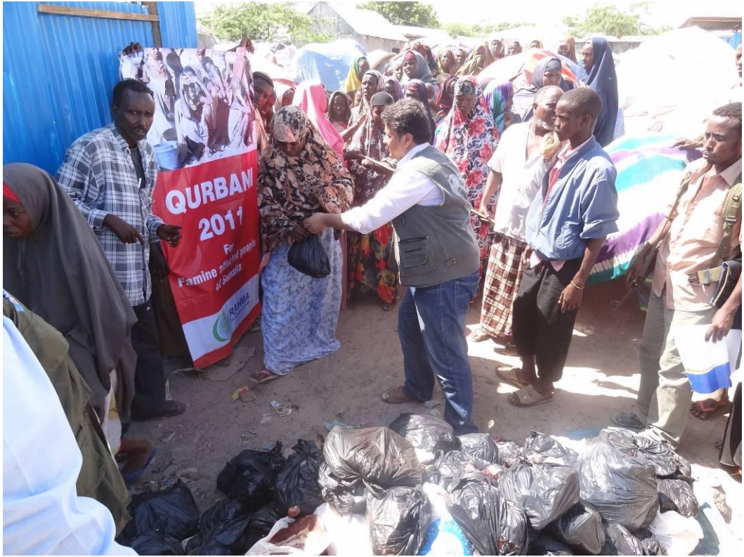
Figure 19 Rahma staff distributing qurbani meat