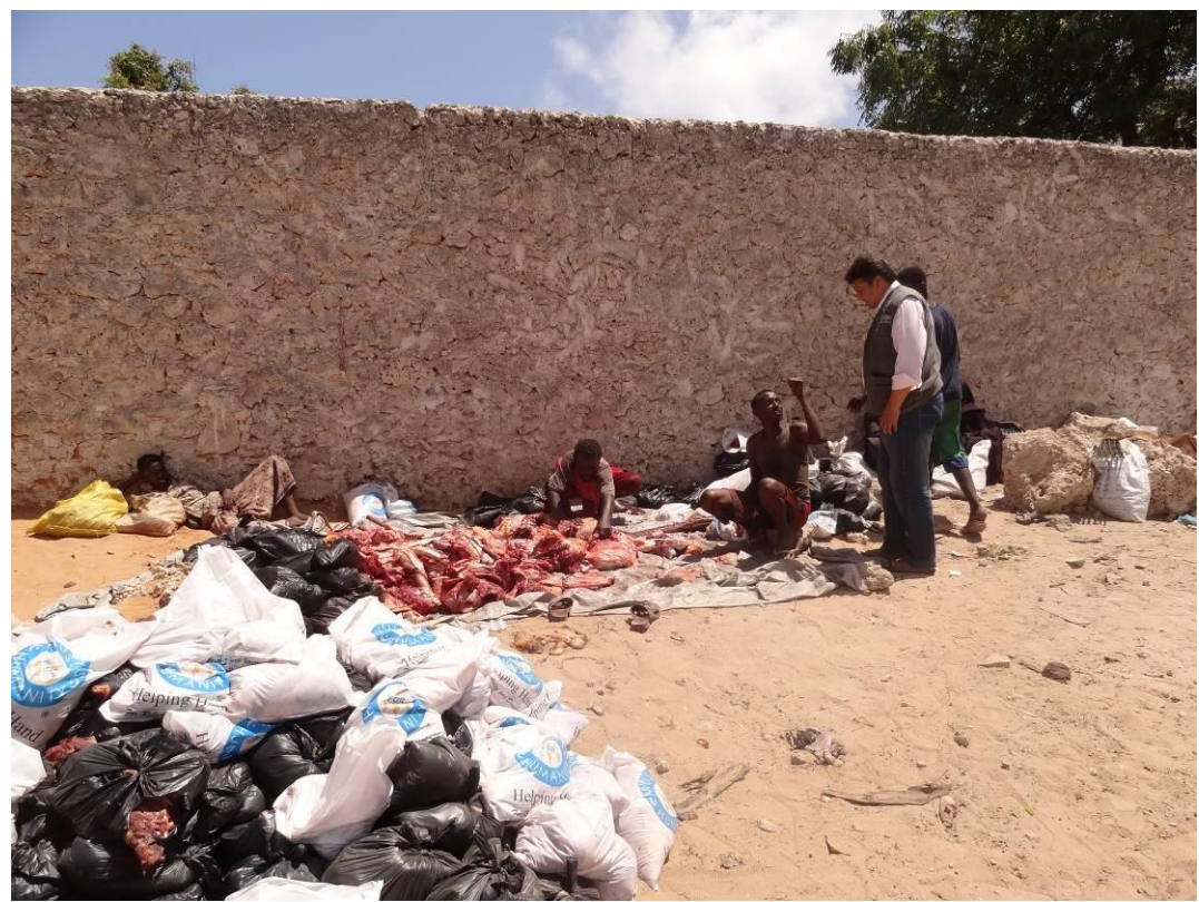
Figure 6 Chopping & Packing Process being observed