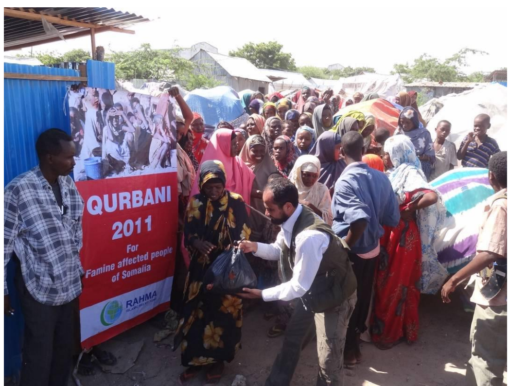
Figure 20 A woman is collecting the meat from HHRD staff