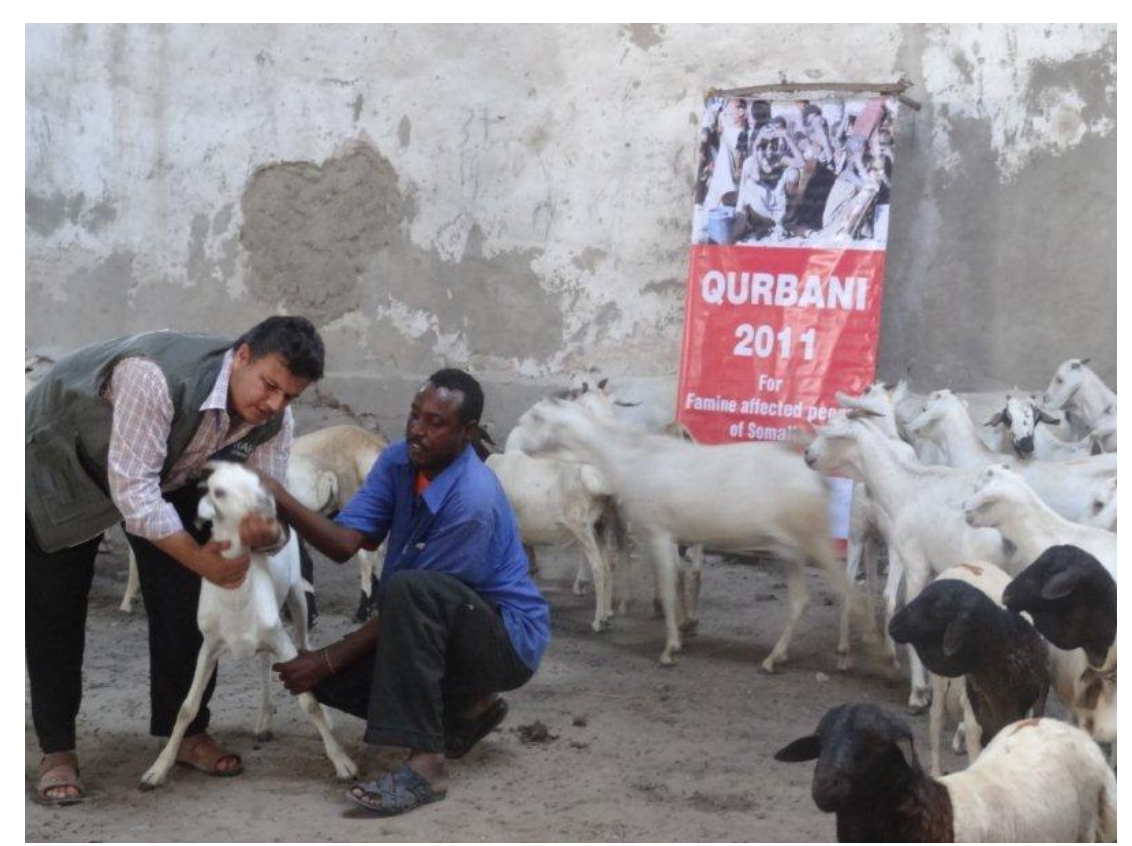
Figure 2 Making sure the health and age of the animal is as per Islamic injunctions