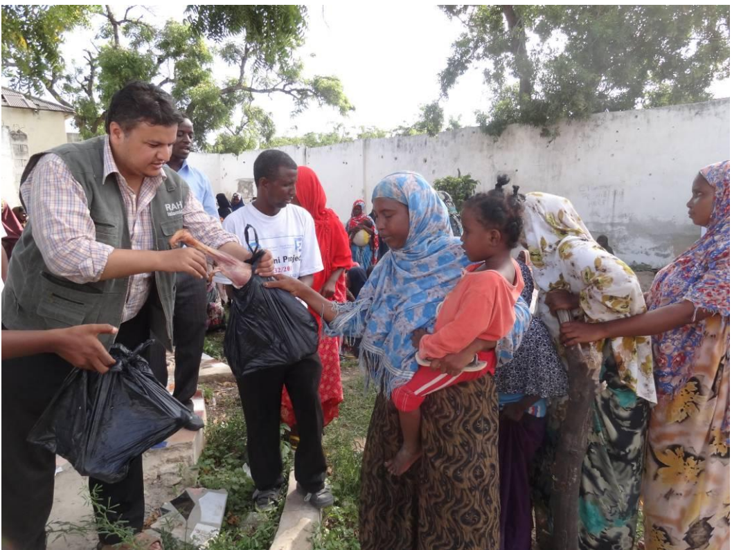
Figure 11 A woman beneficiary collecting meat package from Rahm Staff