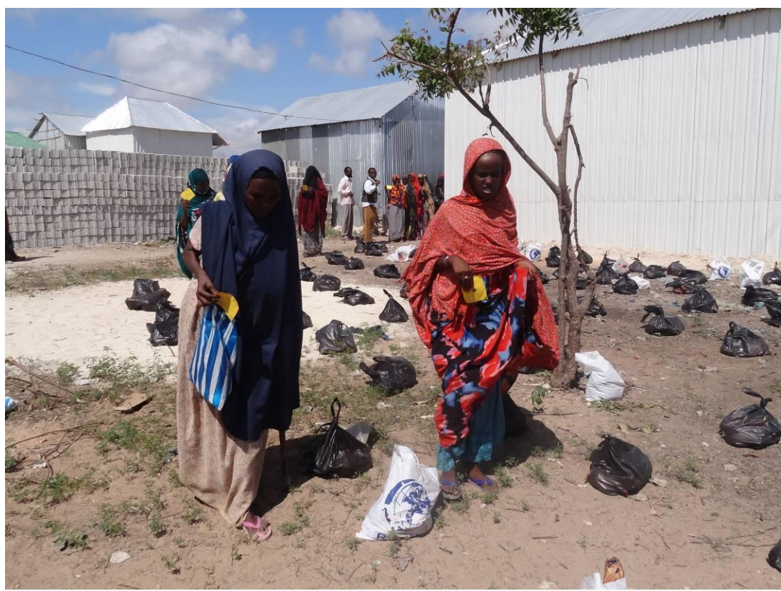
Figure 8 Women beneficiaries at first...inside distribution point