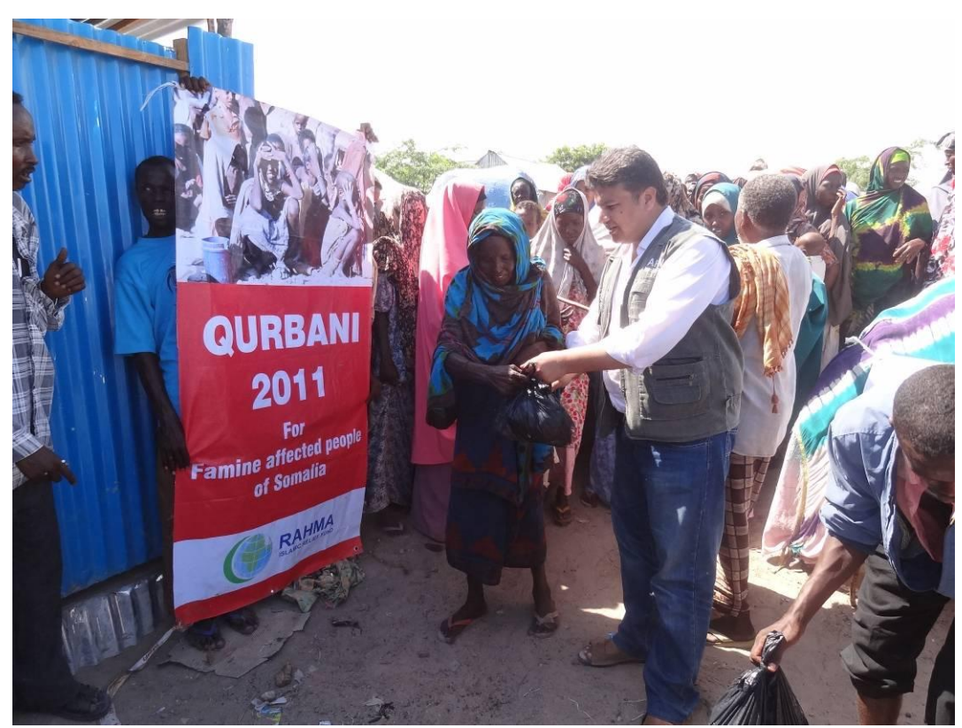
Figure 18 An old woman collecting the qurbani meat inside of her camp