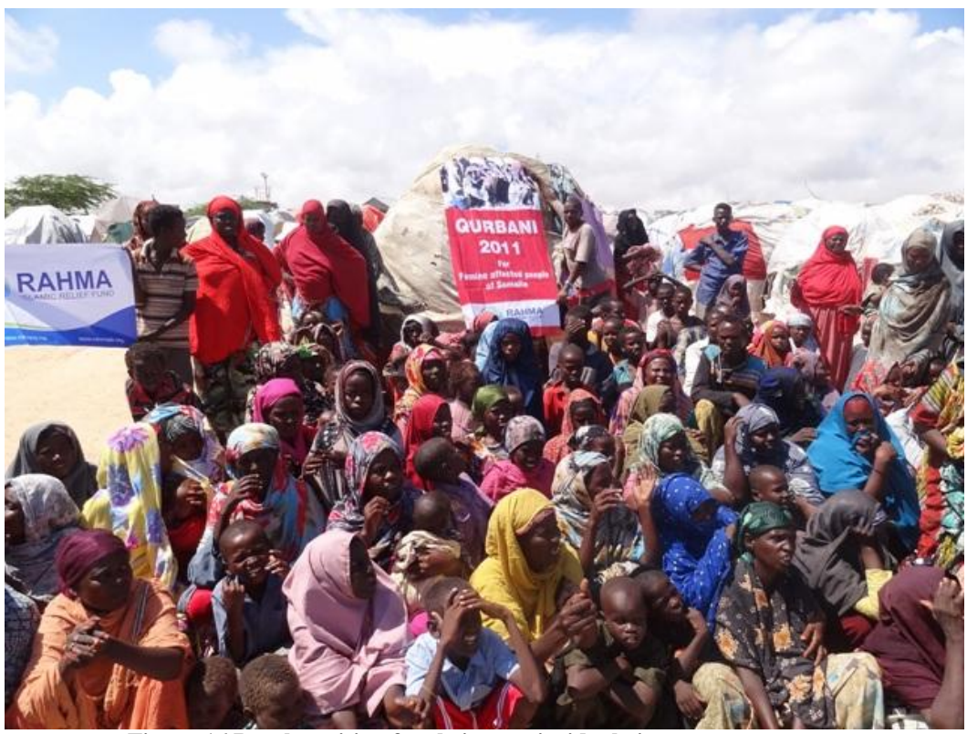
Figure 16 People waiting for their turn inside their camp