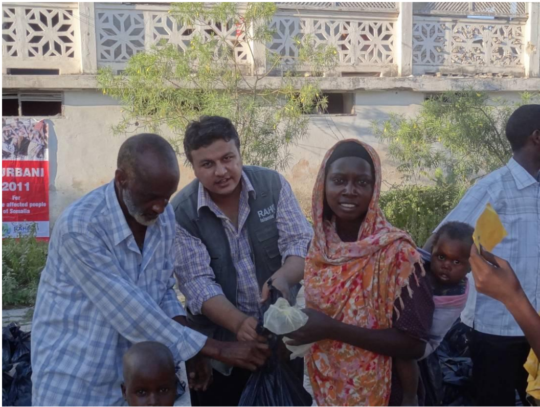
Figure 13 A woman collecting meat pack, she came along with her children