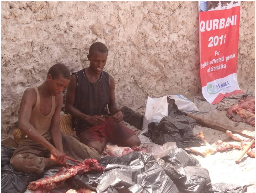
Figure 5 Chopping meat at Qurbani compound