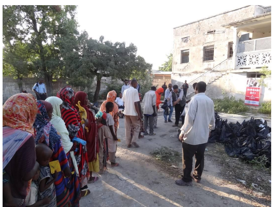
Figure 12 Distribution at Allah Magan Camp