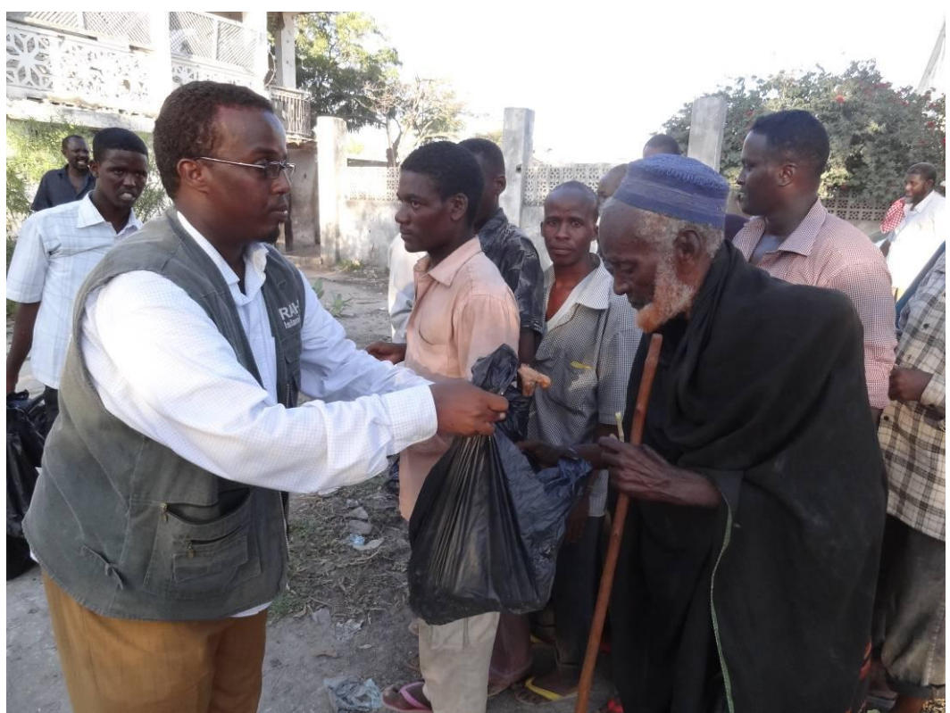
Figure 15 An old man collecting his share