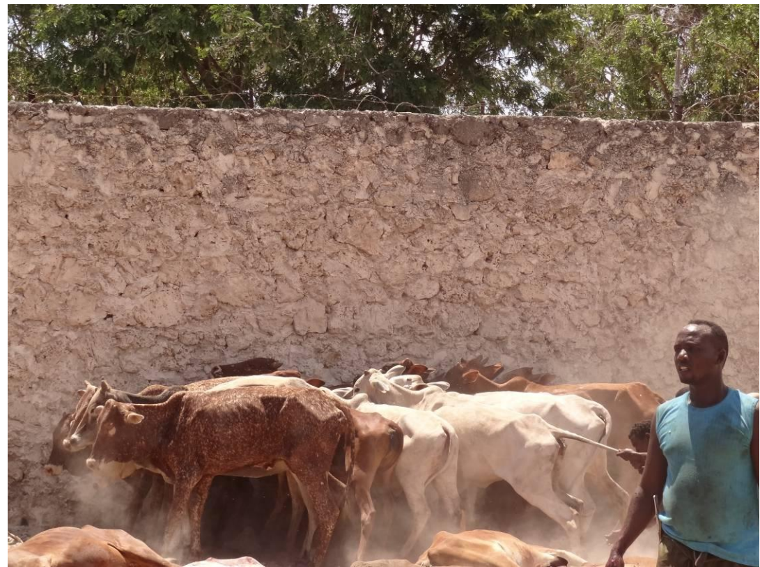
Figure 4 Cows ready for qurbani