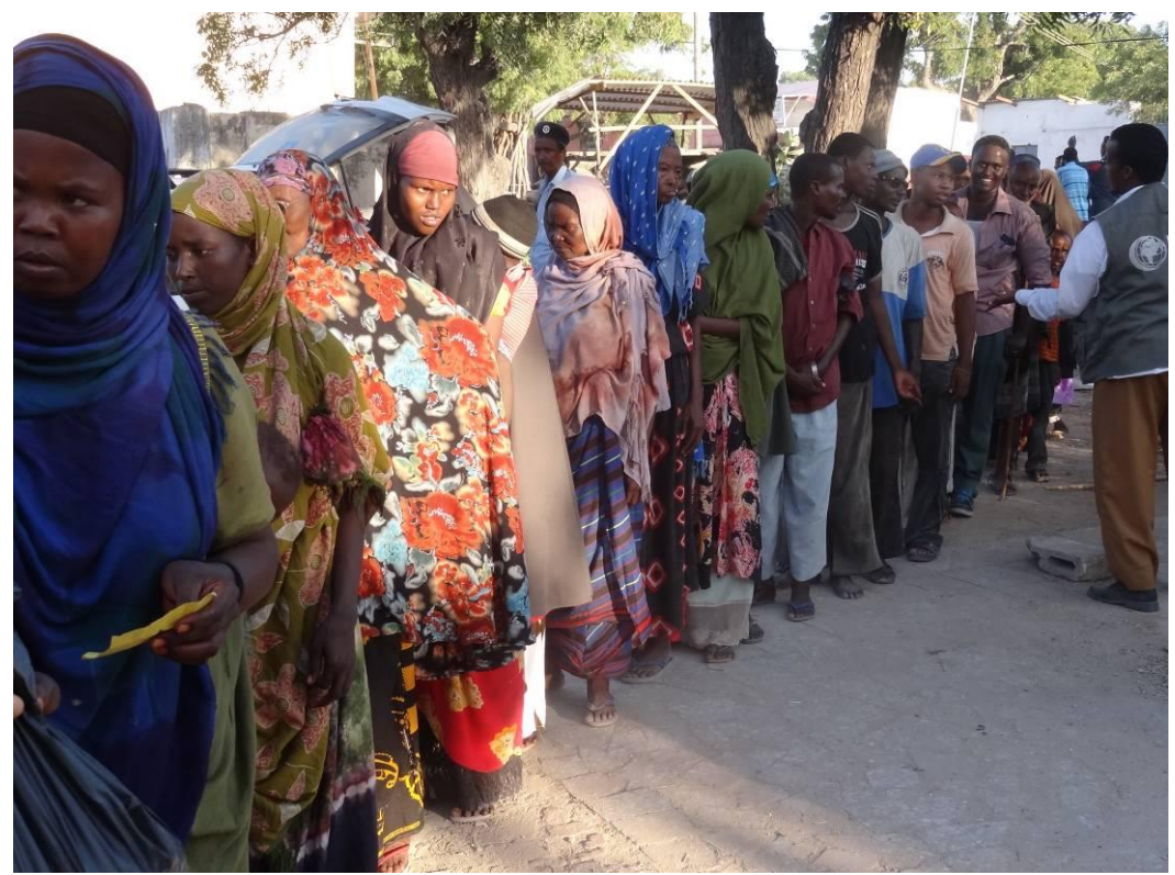
Figure 14 Beneficiaries in queue