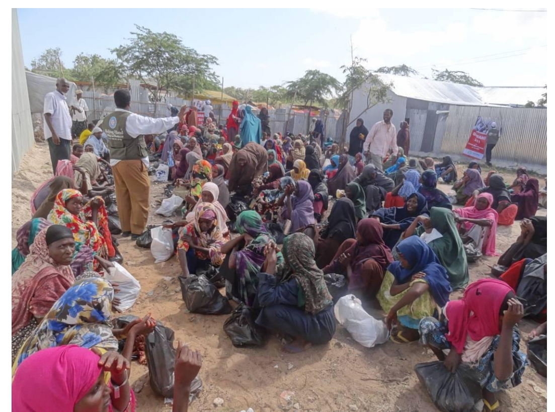
Figure 10 Beneficiaries are listening, while the good wishes of Muslims of Norway being communicated