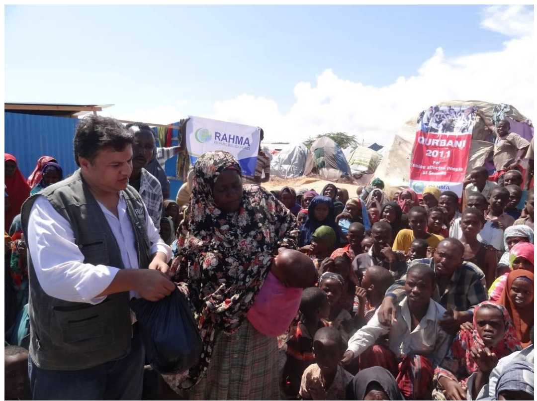
Figure 17 A woman showing her baby while collecting the qurbani meat