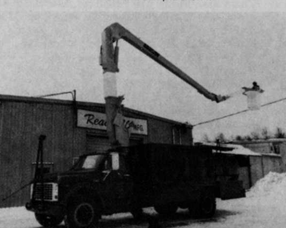
REACH-ALL increases your working area with its modern 3 knuckle design and includes fiberglass lower boom insert.