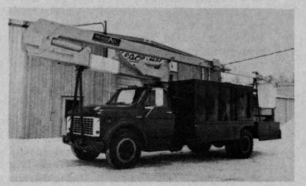
REACH-ALL Model 5050 3K aerial basket with hydraulically powered 12" chipper, a hydraulic ejection box and tool boxes. All assembled as one complete unit.