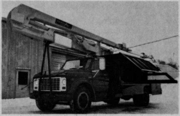
Hydraulically operated chip boxes, either side or end ejection.

A 3 knuckle aerial unit with your choice of 136° or 270° third knuckle.