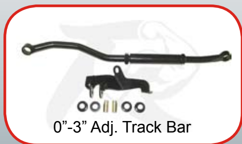
0"-3" Adj. Track Bar

P/N 708 will fit the following vehicles: