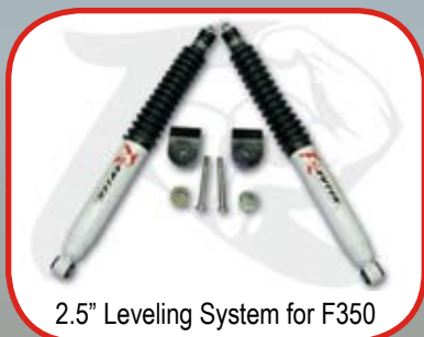
2.5" Leveling System for F350

P/N 6125 will fit the following vehicles: 2005-2010 F250