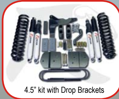
4.5" kit with Drop Brackets