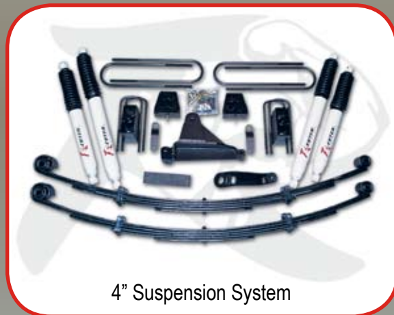
4" Suspension System