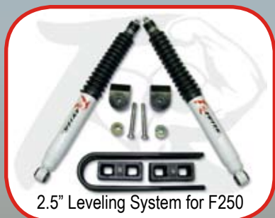
2.5" Leveling System for F250

P/N 6125 will fit the following vehicles: 2005-2010 F250