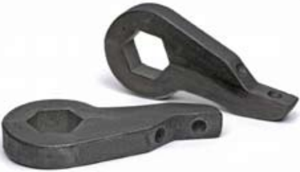
Torsion Lift Keys for F150