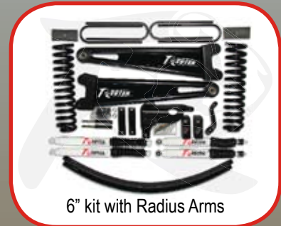
6" kit with Radius Arms