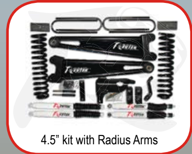
4.5" kit with Radius Arms