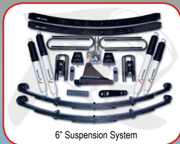
6" Suspension System