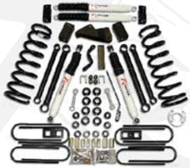
4.5" Suspension Lift System