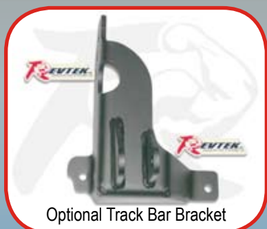
Optional Track Bar Bracket

P/N TSD562 will fit the following vehicles: 2005-2007 F250/F350 4WD