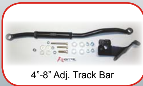
4"-8" Adj. Track Bar

P/N 709 will fit the following vehicles: