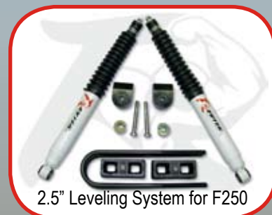
2.5" Leveling System for F250

P/N 6126 will fit the following vehicles: 2005-2014 F350