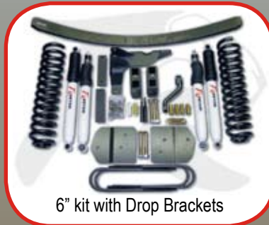
6" kit with Drop Brackets