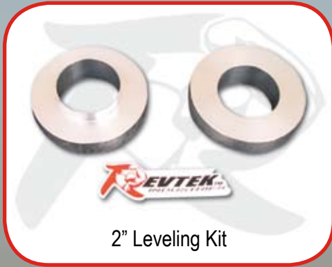
2" Leveling Kit