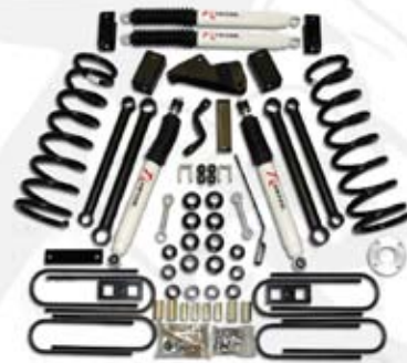
6" Suspension Lift System