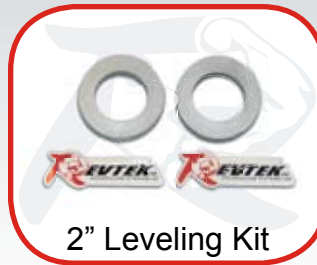
2" Leveling Kit

1994-2001 1500 4WD 1994-2013 2500 4WD 1994-2012 3500 4WD 2006-2009 1500 Mega Cab 4WD