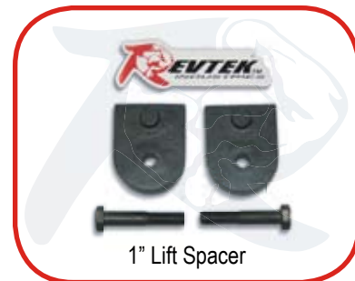
1" Lift Spacer