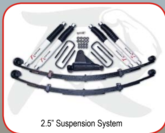
2.5" Suspension System