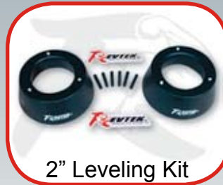
2" Leveling Kit

P/N 702 will fit the following vehicles: