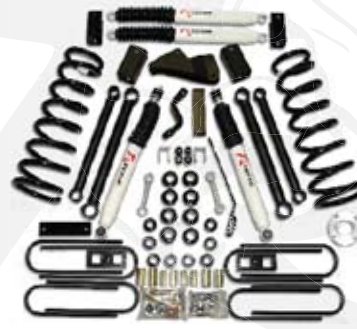
6" Suspension Lift System