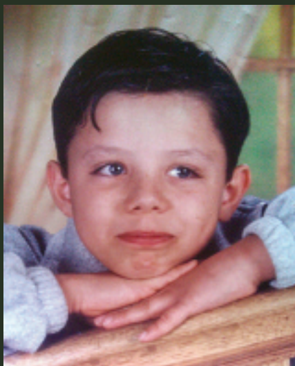
A photograph of Ethan A. (pseudonym) held by his mother, showing her son at age 11, four months before he was arrested for committing a sex offense and placed on the sex offender registry in Texas.

Human Rights Watch calls on states and the federal government to exempt youth sex offenders from registration in combination with community notification. Short of a full exemption, states should remove all youth sex offenders from registration schemes that are not specifically tailored to take account of the nature of their offense, the risk they pose (if any) to public safety, their particular developmental and cognitive characteristics, their needs for treatment, and their potential for rehabilitation.