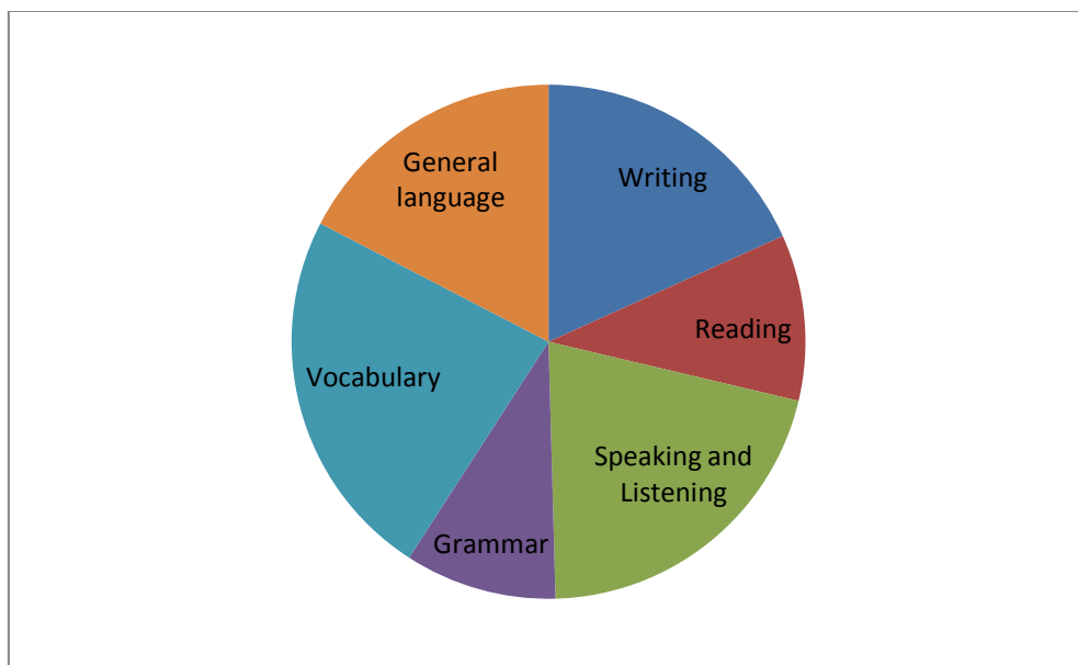
Figure 3.2: Distribution by competence of items included in the synthesis of evidence