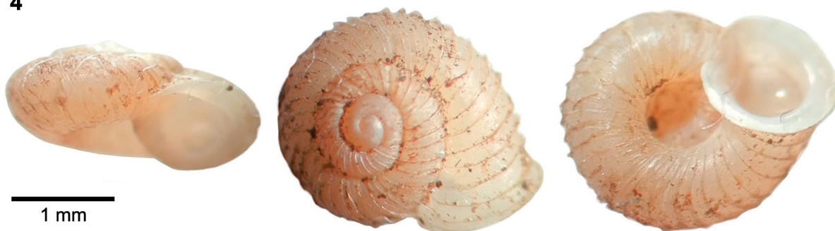
Figs 3–4. Specimens of Vallonia from the new sites: 3 – V. enniensis (specimen from site 1), 4 – V. costata (specimen from site 2)