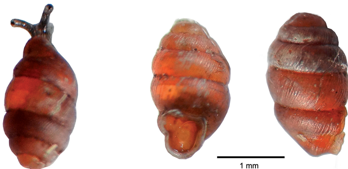
Fig. 2. Vertigo angustior – crawling individual and shell (specimen from site 2)

2004): V. moulinsiana as critically endangered (CR category), V. angustior as endangered – (EN). Both species are also included in the Red List of Threatened Animals in Poland (WIKTOR & RIEDEL 2002). In the IUCN Red List of Threatened Species V. moulinsiana is classified as vulnerable (VU category) while V. angustior is near threatened (NT) (KILLEEN et al. 2012, MOORKENS et al. 2012). Around 50 records of V. moulinsiana and over 120 records of V. angustior