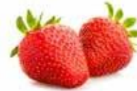
Strawberry (Whole -Diced - Sliced)