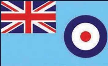
Royal Air Force