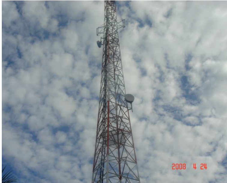
A typical POP in Tororo town

Through a competitive bidding process, the Uganda Telecom Ltd won the tender for subsidy to set up POP in the district.