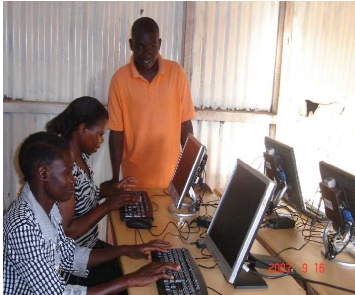
A typical ICT training centre/Internet café in Amuria town, Amuria district

Like all other projects of RCDF, the facilities are established as partnerships between UCC and a private or public partner.