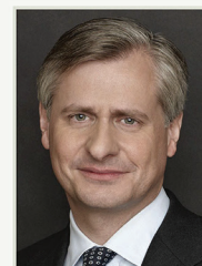
Presidential Guest Speaker Jon Meacham