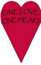
A 5K Walk/Run benefitting the CdLS Foundation

“One Love refers to the universal love and respect expressed by all people for all people.” This is the theme for the “One Love, One Heart” 5K in Decatur, GA, that took place on December 7. The cold winter temperatures (it was 30 degrees warmer the day prior!) did not discourage more than 200 runners and walkers from enjoying a morning run. Seven CdLS families joined the activities helping raise awareness and funds for the Foundation.