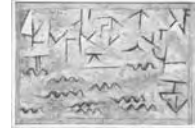
Der Rhein bei Duisburg Paul Klee

Cover illustration: Detail of Der Rhein bei Duisburg , 1937, 145(R 5) Rhine near Duisburg 19 × 27.5 cm; water-based on cardboard; The Metropolitan Museum of Art, N.Y. The Berggruen Klee Collection, 1984. (1984.315.56)  © 2003 Artists Rights Society (ARS), New York / VG Bild-Kunst, Bonn