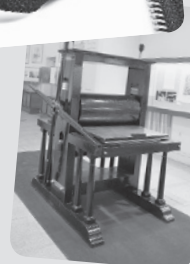
The printing press