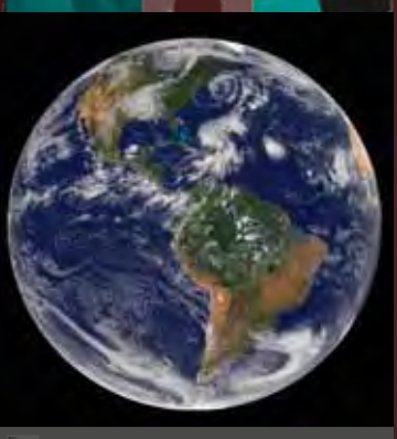
Around The World