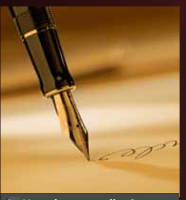
► How do you spell ...?