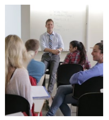
The first day of class presents an important opportunity to create the foundation for positive relationships.

This section focuses on ways to establish norms and expectations for your classroom community and provide opportunities to connect with students' individual needs. Suggestions for both face-to-face and online approaches include specific examples and suggestions from CSUCI faculty. Following these instructional suggestions is a section on advising that describes ways to extend your classroom community by mentoring students on an individual basis.