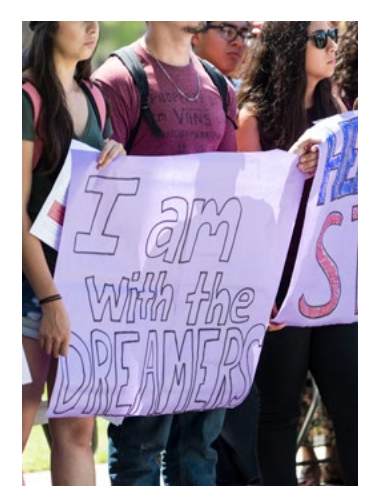
There is training available for faculty and staff to become an Undocumented Student Ally.

Immigration also creates a financial burden for students and families; legal fees and representation are expensive and many times unplanned. Application and consultation fees can range from hundreds to thousands of dollars. If everyone in the household does not have a work permit, the student may be in the position of working multiple jobs to cover household expenses. Moreover, if a student or a family member is detained, federal and legal representation fees will apply without warning and can easily exceed thousands of dollars. Students who are DACA are often the most legally protected person in their households, and this creates many responsibilities that would not be common for a typical college student. These additional burdens interfere with their ability to pay tuition, attend classes and perform to their highest potential.