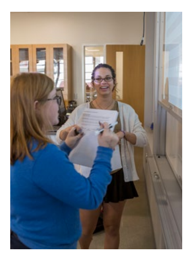
Cultivate participation in the classroom through interaction and group activities.

language: "For extenuating circumstances related to a medical condition or disability for which you may require reasonable accommodation, please refer to the Disability Statement."