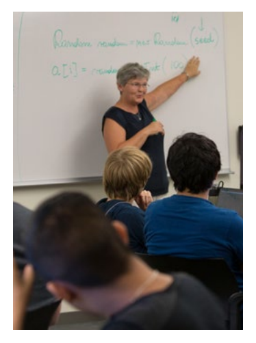
When addressing disruptions, be sure to document the event, especially if there are multiple instances.

a way to solve problems, expressions of anger/agitation/inability to cope with stress, appearing disconnected from reality, or excessive hygiene problems. If you are unsure what to do, and you have any potential concerns about safety for the student or others, trust your gut instinct and call the University Police Department.