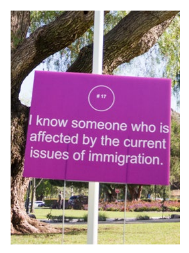
Undocumented students are often dealing with many obstacles inside and outside of the university setting that may make it very difficult to focus on their academics.