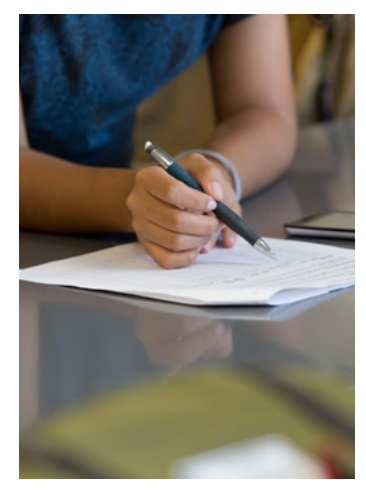
Disturbing writing or artistic work may indicate an unusual style, but paired with other behaviors it could indicate something more going on.

Consult with your Program Chair, Dean, or Supervisor. Counseling and Psychological Services (CAPS) is also available for consultation (805-437-2088) to determine if referral, immediate intervention, or outreach to the student is indicated. The clinician may also provide suggestions about how to talk with the student.