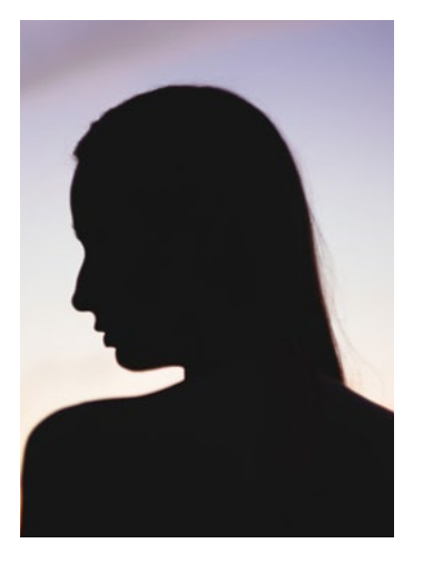
Pay attention to the warning signs and what a student is saying as they reach out to you. If you are concerned for a student's safety, contact the police immediately.

Some students who contemplate killing themselves have a mental illness and some do not. A percentage of suicides and attempts are impulsive. Students who are vulnerable to suicidal states may be more at risk during college. Away from home, isolated from familiar support systems, and experiencing pressure to perform, these students may become overwhelmed and begin to feel hopeless about their present situation or future. Major mental illnesses can also manifest during a person's early 20s; a student who is unaware of the cause of their newfound symptoms may turn to suicide as a way to end the confusion and pain.