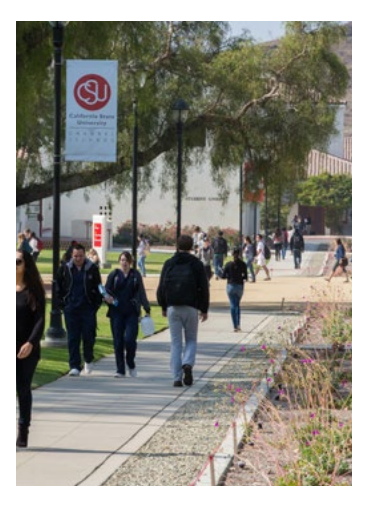
Assault, harassment and stalking can have severe and detrimental effects to a student's health, wellbeing and academic success.

Although students often do not report this type of behavior, hoping it will go away, it can have serious consequences for the victim. Stalking victims often become distracted, anxious, tense, sensitive, and jumpy, and the uncertainty of when or where the perpetrator may strike next can lead to tremendous fear.