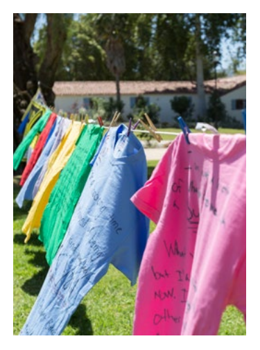
It is important to articulate that any harassing or violent behavior directed at the student is not the student's fault nor is it acceptable in our community.