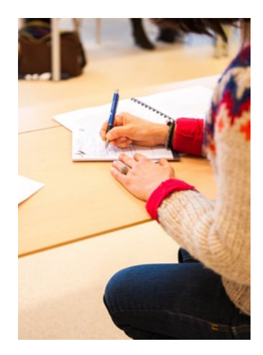
Students who are struggling academically are often trying to balance heavy work and life responsibilities.

CSUCI has an Academic Advising Center to support students through academic difficulty. Students who fall below a 2.0 are put on academic