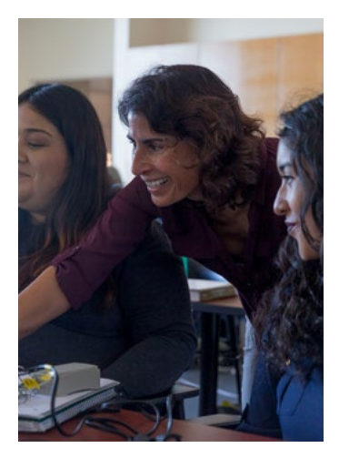
Faculty who make it a priority to foster trust and maintain availability encourage students to attend office hours.