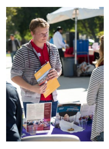
There are several resources for our students looking to further their education by pursuing graduate school.

Given that completing a career-related internship is a critical component of workforce preparation, whatever you can do to support and educate students to understand the value of an internship experience provides a key opportunity for CSUCI as a campus.