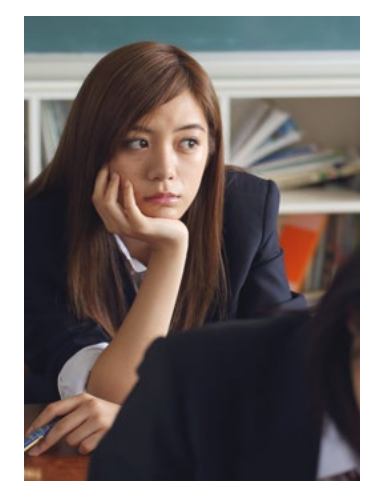
Faculty are encouraged to address low-level behaviors such as sleeping, staring, or interrupting.