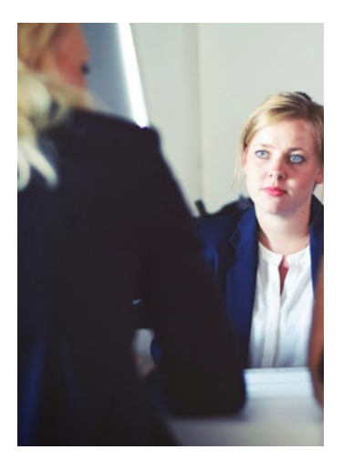
When speaking with a student of concern, it's important to listen by asking open-ended questions and allowing them to talk.