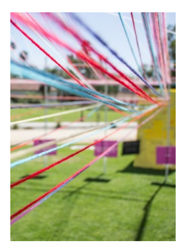
Being aware of the range and intersectionality of identities will promote a supportive environment for our students.

relationships with those of either binary gender. Asexual is the general word for someone who does not experience physical or romantic attraction to anyone.