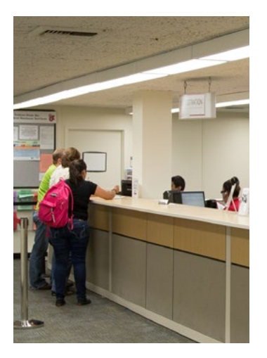
Everyone in our campus community has the opportunity help. If you encounter a student of concern, speak with your supervisor.

Chapters 1 and 2 in this handbook include a list of indicators that you may observe in your interactions with students; a list of resources is also provided that may help you refer students so they can get help.