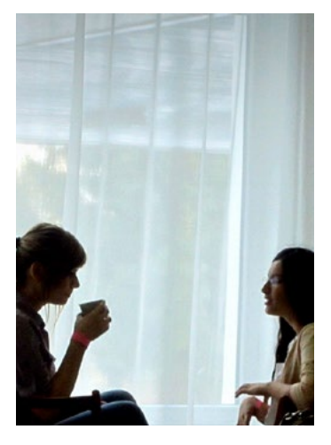
Faculty and staff who express their concerns for a student can have a profound and positive impact on the student.

the fact that substance problems often co-occur with other mental health conditions such as clinical depression, eating disorders, and attention deficit/ hyperactivity disorder.