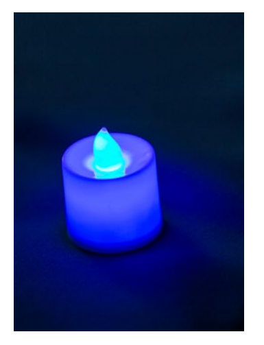
It's important to recognize that every student will have a different level of functioning.