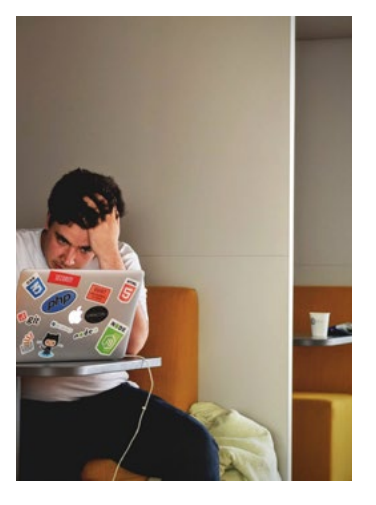
Physical signs of exhaustion can indicate a student is in need of support.