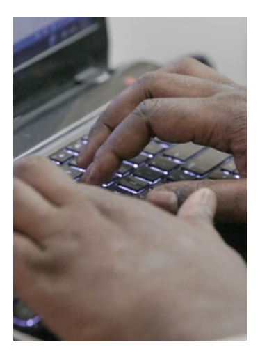
Online classes can be challenging to facilitate. There are many resources faculty can use to make connections with students.

If you have students monopolizing or disrupting the discussion, it's a good time to go back to the ground rules and remind students of the norms for interactions in your class. You are the one who creates a safe space for students to participate, so protecting that space is important, even if it means asking a persistent student to "Hold that thought" until you can talk privately at the break about the need to tone down or limit responses.