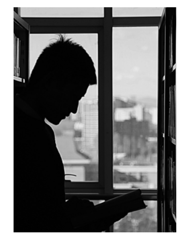
If you're not sure whether or not a student needs help, check-in with them and get a better sense of their situation.