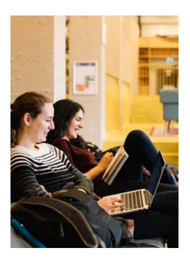
Universal Design Instruction gives all students the opportunity to learn in ways best suited for their needs.

• Different means of engaging with the course material: For example, offer some variety in course assignments, such as a balance between individual and collaborative work, so students build on their strengths while being exposed to different ways of working.