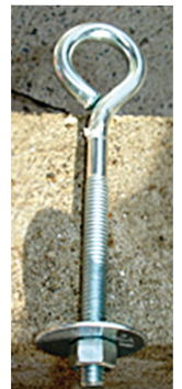
Fig. 7. Eye-Anchor

Eye-Anchor (Fig. 7) – CR Steel Eye-Bolt min. 3/8" diameter x 6.0" long w mating large diameter washer & nut fixed under Remesh and cast into concrete min. 4.0" deep rated for at least 1/2 the buoyant force.