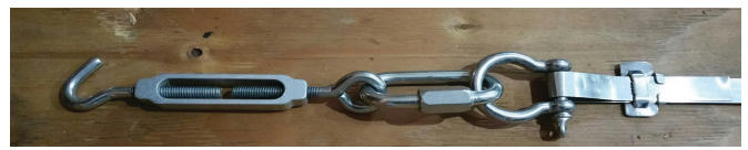
Fig. 12. CR metal band & Clamp with D ring and turnbuckle

Metal Band (Fig 12) – Band-It Model C206BB Steel Band Kit (Granger Item # 13E234) or equivalent 3/4" W x .030" thick stainless steel band and crimp