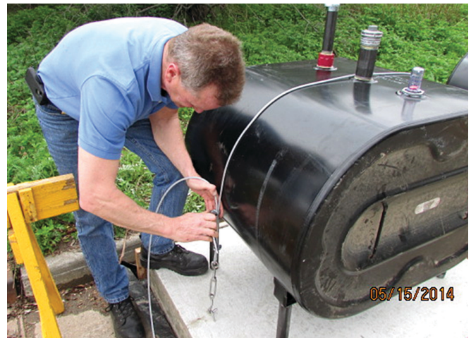
Fig. 13. Installer performing wire rope tie-down.

Quick Link – CR Steel Quick Link w threaded closure min. 1/4" diameter w 3/8" opening/loop space rated for at least ½ the buoyant force.