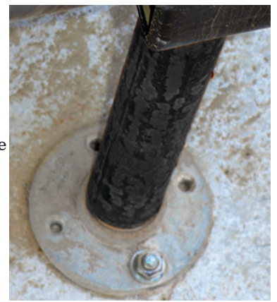
Fig. 5. Design A1 foot flange with bolt

Design A2 (Fig. 6)– Foot Flange and Concrete Screw Photo detail of large diameter flange and 2-screw combo for new or existing slabs before and after assembly: