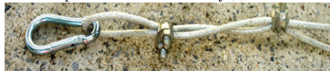
Fig. 11. CR metal wire rope with u-clamps and quick link

Rope Ends – CR metal fittings with thimbles sized for wire rope diameter and secured by (a) steel cable