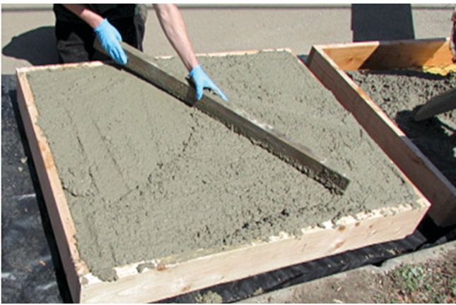
Fig. 3. Concrete slab

3. To prevent accelerated corrosion in pipe legs, installers should NOT seal the foot; they should, however, cap the top ends or create a weep hole in the concrete under the foot.