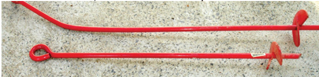
Fig. 10. 40" length and 30" length earth augers

Grainger 4LVK4 or equiv 30" long with 3" diameter auger screwed in earth under slab at a 45 degree angle, from horizontal, minimum 24" deep.