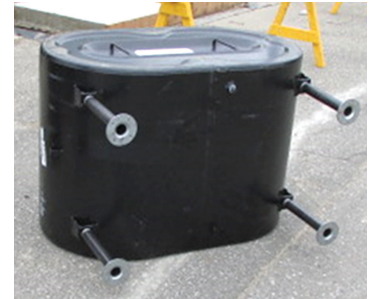
Fig. 1 – General photo of assembled tank and slab before anchoring - Note all photos are of 1/2 size horizontal obrounds tested, but the hold down methods apply to vertical obrounds.