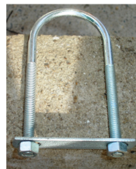
Fig. 8 U-Anchor

Design B1 or B2 –Detail of eye or U anchor options for casting in new concrete slabs and connection to hold-down and connection options. Four required–each positioned +/- 4" off leg/support centrally.