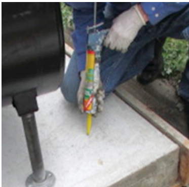
Fig. 4. Adding adhesive to the drilled hole

CR = Corrosion Resistant, such as stainless steel or plated steel rated for outdoor use.