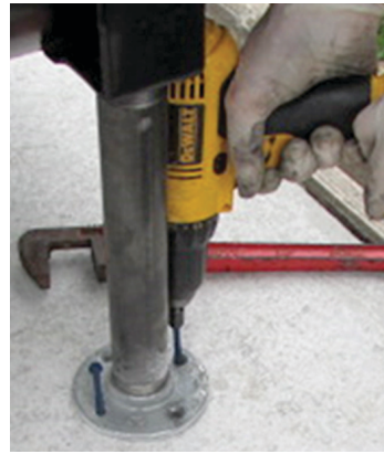
Fig. 6. Concrete screws installed after hole has been cleaned and adhesive added

Foot Flange – Mueller Model 301-F114 (Home Depot SKU# 564311) or equivalent 1.25" Floor Flange – 3.50" diameter black iron w pipe threads and four holes screwed onto tank pipe leg and secured with two concrete screws/foot into opposite holes