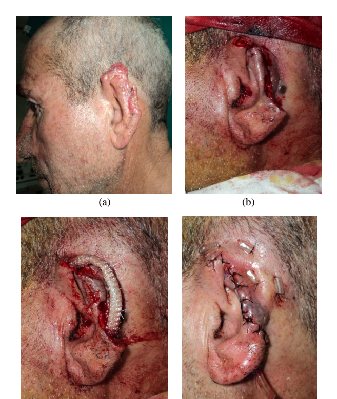
Figure 1. (a)-(d) First stage of the procedure. (a) Tumor is involving the upper and middle thirds of auricle; (b) Tumor excision with safety margin; (c) Fabricated mesh fixed in its place; (d) Coapted skin over the mesh.

The 2^{nd} stage was done 6 - 8 weeks after the 1^{st} stage, a skin incision is made 1 - 1.5 cm behind the posterior margin of the frame, then the dissection was performed beneath the frame work taking care to preserve a enough connective tissue layer on the frame, until the sufficient amount of projection and creation of retroauricular sulcus