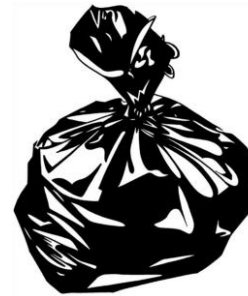
Trash Pay-As-You-Throw (PAYT)