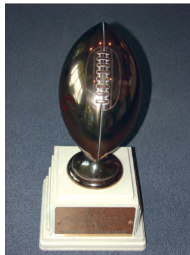
1959 Championship Trophy

HSU vs. Arkansas Tech Homecoming Football Game Saturday, October 24, 2009 at 3 p.m. Carpenter Haygood Stadium