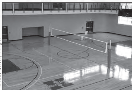
Alumni / Sherry Wright