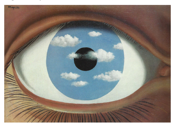
Figure 1: Front cover of The Figure Landscapes Within