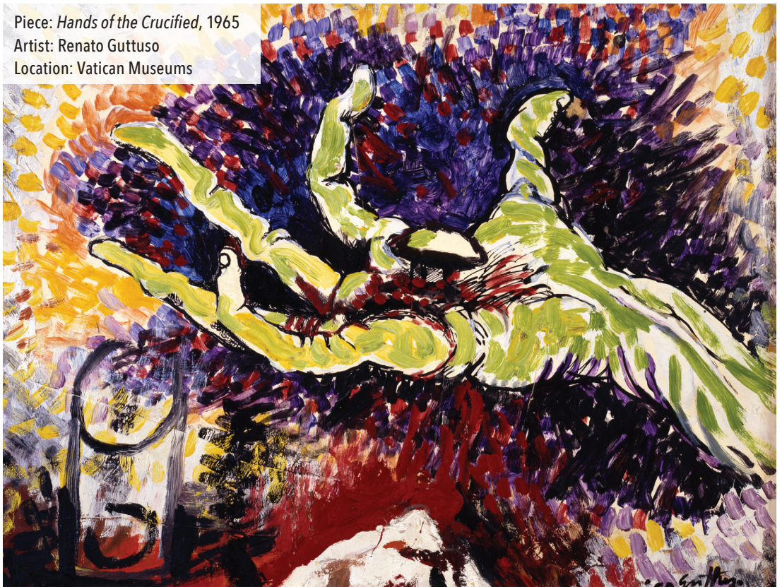
Piece: Hands of the Crucified , 1965 Artist: Renato Guttuso Location: Vatican Museums