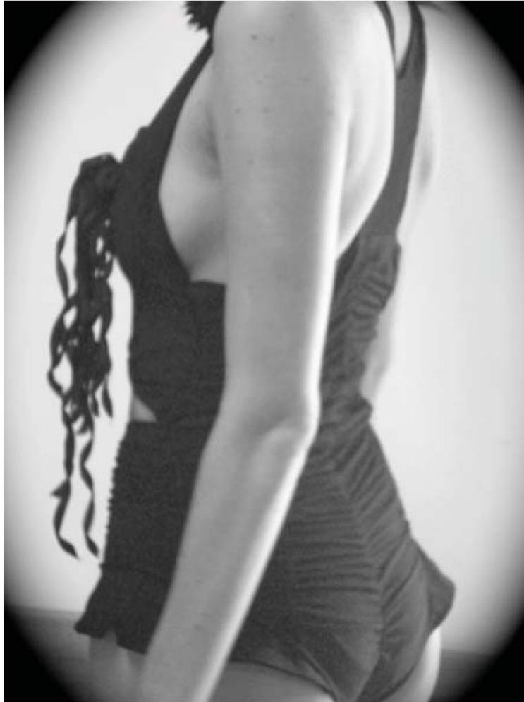
Figure 4. A student-produced/uploaded image

many potential employers for design positions seek to view this material. As Gray and Malins (2004) argued, for design practitioners, reflective journaling provides a useful model to extend professionalism and to engage in better conversations.