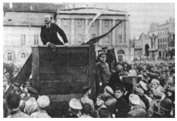
Lenin speaking at rally in Petragrad 5-5-1920

By 2017, fifty years of almost unchallenged revisionist domination of the international communist movement now requires the rediscovery of Leninism and its amazing revolutionary fruits.