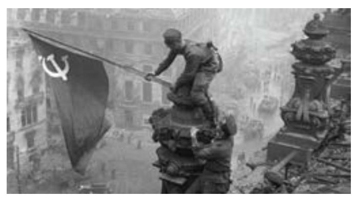
Soviet Red Army in Berlin

Moreover, little more than twenty-five years after the victory of Red October, came the Soviet-led defeat of world fascism in World War II featuring the triumphant Soviet Red Army march through Europe driving the previously undefeated Hitler-led German fascist army all the way to Berlin, paving the way for the creation of peoples democracies across Eastern Europe in its wake. And just a few years later, little more than thirty years after the October Revolution, having received invaluable aid from the Soviet Union, the Chinese Communist Party led a victorious national democratic revolution over the U.S. imperialist-backed Chiang Kaishek and his Kuomintang army and regime, liberating one-quarter of humanity.