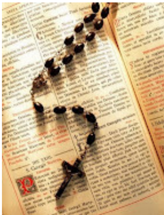
The Holy Rosary is a prayer based on the Bible.

“There has also been felt with greater urgency the need to point out once more the importance of a further essential element in the Rosary, in addition to the value of the elements of praise and petition, namely the element of contemplation. Without this the Rosary is a body without a soul, and its recitation is in danger of becoming a mechanical repetition of formulas and of going counter to the warning of Christ: “And in praying do not heap up empty phrases as the Gentiles do; for they think that they will be heard for their many words” (Matthew 6:7). By its nature the recitation of the Rosary calls for a quiet rhythm and a lingering pace, helping the individual to meditate on the mysteries of the Lord’s life as seen through the eyes of her who was closest to the Lord. In this way the unfathomable riches of these mysteries are unfolded.” [Source: http://www.vatican.va ]