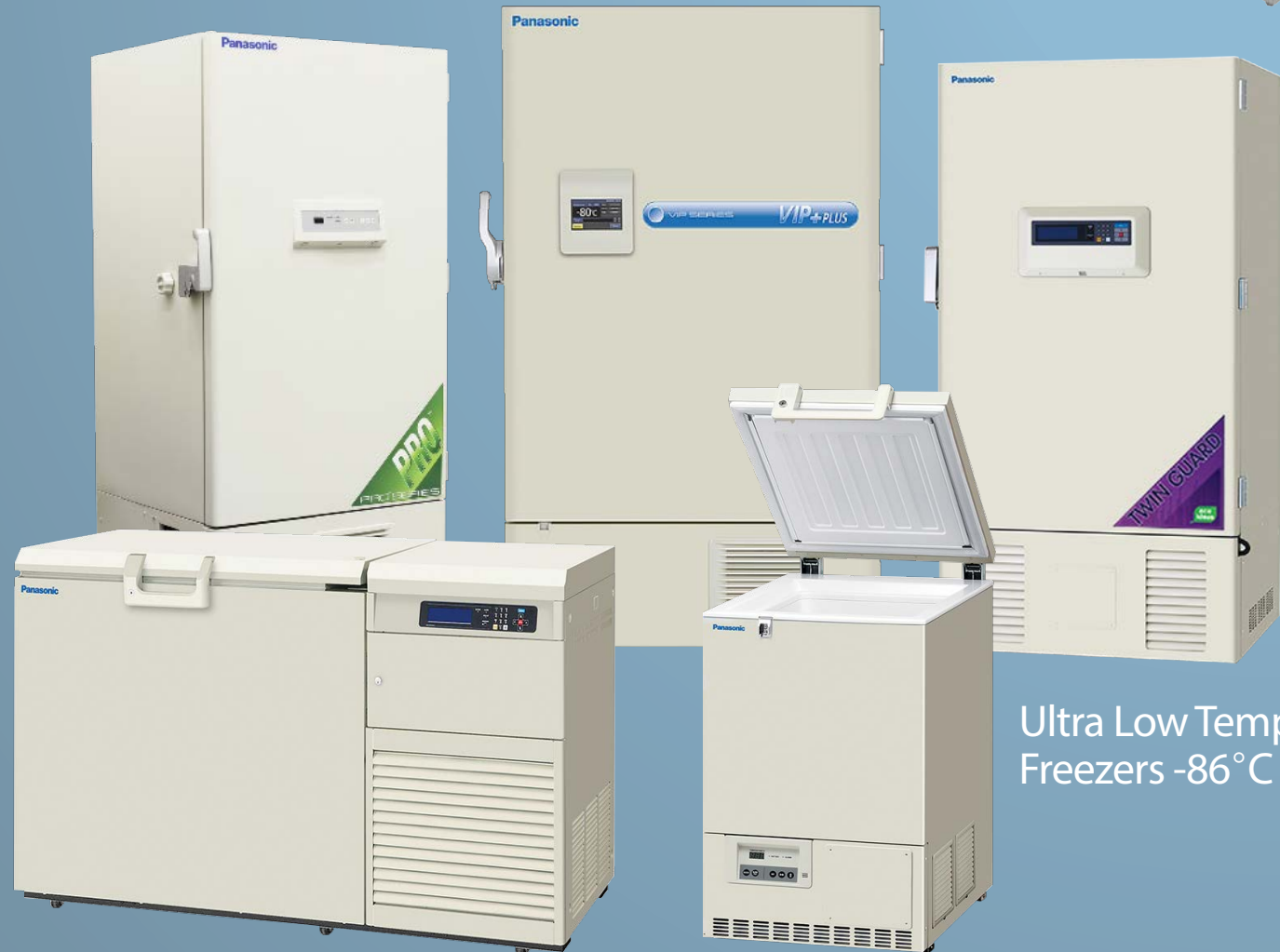
Ultra Low Temp Freezers -86°C