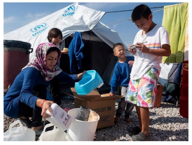
UNICEF-supported Wash and Dignity Kits are distributed at the new RIC (KARA TEPE) on Lesvos island. Greece.

In the last quarter of 2020, UNICEF immediately initiated an emergency response for children and women displaced by the 9 September fire that destroyed Moria RIC on Lesvos. Support included provision of emergency accommodation for UASC and