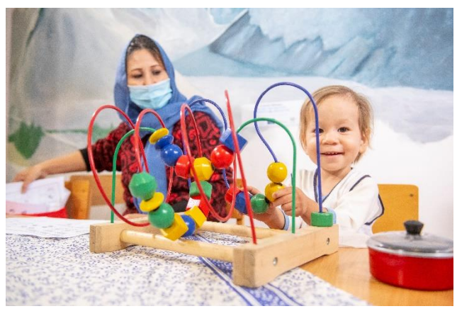
A mother and her son spending time in a UNICEF supported mother corner in Adra, Serbia.

Considering the COVID-19 pandemic, UNICEF has intensified distribution of critical supplies to support infection prevention protocols in 2020. Dignity/hygiene kits for women, girls and boys, were prioritized, and have been distributed by partners to four asylum and reception centres.