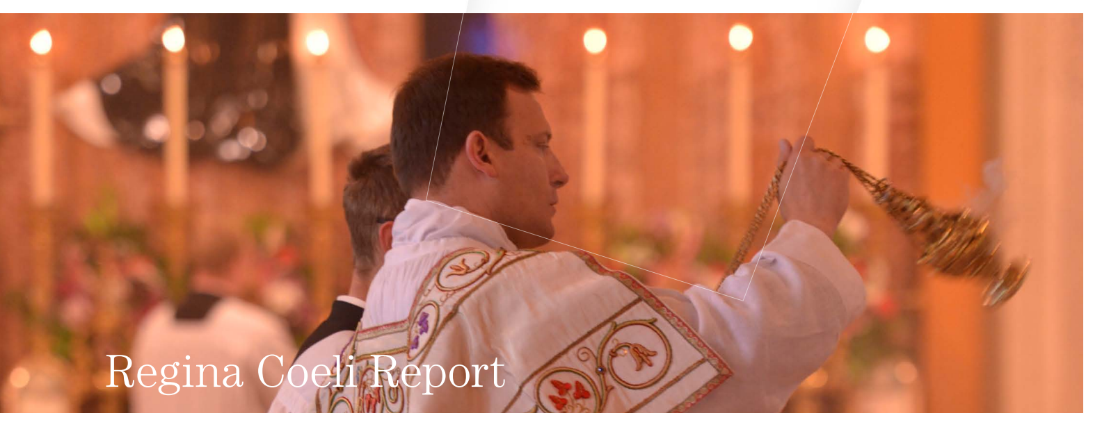
Number 265 September 2015 ::