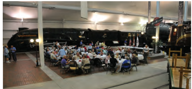
Catered dinner at the National Railroad Museum.

Wednesday's focus was the National Railroad Museum in Green Bay, whose collection includes Gen. Dwight Eisenhower's staff train from WW II, and a Union Pacific Big Boy articulated locomotive, one of the biggest steam locomotives ever built.