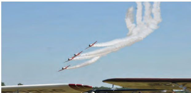
First stop: EAA AirVenture air show.

Monday was spent at the EAA AirVenture fly-in in Oshkosk, including the world-famous air show and an REO Speedwagon concert.