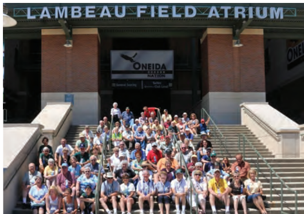
Rally goes on the steps of Lambeau Field.

The next day was spent touring Lambeau Field, the home of the Green Bay Packers, the Hall of Fame, and lunch at Brett Favre's Steakhouse.