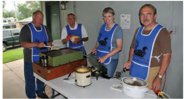
Minnesota Unit breakfast burrito team.

Food at this rally was outstanding, with creative breakfasts (largely due to the efforts of the Minnesota Unit), excellent catered meals, and happy hours!