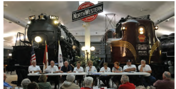
Impressive place for a business meeting!

Thursday included region leadership meeting and member "round table" discussions, followed by a trip to a nearby American Legion hall for another great catered dinner and brown bag auction, which raised more than $1,200 for the Wounded Warrior project.