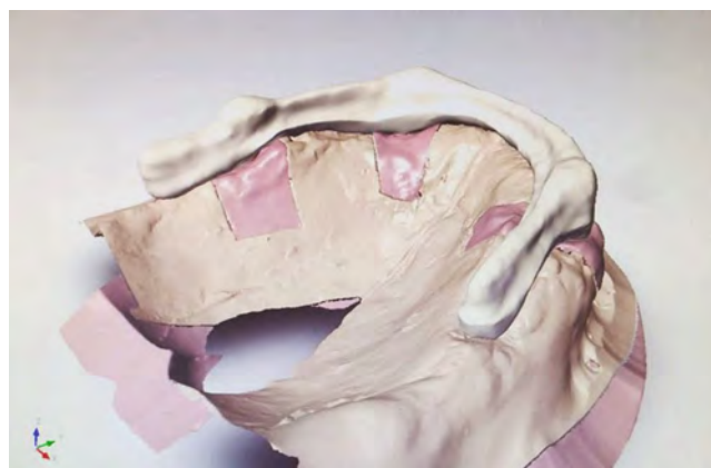
FIGURE 3: Trinia® bar CAD.

Regarding the prosthetic aspect, there are important cantilevers in the distal areas of quadrants 2, 3, and 4, none of which exceeded 21 mm. As for the surgical aspect, the implant in zone 26 was lost due to lack of osseointegration before loading, but the 2-year radiographic follow-up showed the absence of signs of bone resorption around the implants (Figure 6). The fixture was characterized by a conometric connection with the abutments, both made from Ti-6Al-4V alloy, and a calcium phosphate-based treatment. A critical