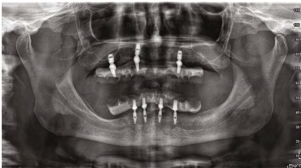
FIGURE 6: Postoperative orthopantomography at the 2-year follow-up.

A recent consensus statement also considers the importance of a balanced occlusion in an All-On-4 protocol [14]. Therefore, correct positioning of the teeth allowed the patient to not only accept the occlusal scheme but also correctly position the implants and avoid forces that cause stress on both the prosthetic and implant components. The desire for a predictable prosthesis, particularly for fixed partial dentures, led to the development of the concept of “prosthodontically guided implantology.” This concept establishes the correct implant position during the diagnostic stage according to planned definitive restoration. The importance of this approach was analyzed by Tallarico and Meloni in a recent multicenter study [15].