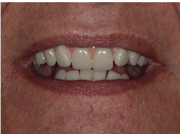
FIGURE 5: Final smile aesthetic results.

However, it was greatly important to start from a correct design of the removable temporary prosthesis. This is to not only satisfy the aesthetic requests of the patient but also create a prosthesis respecting the neutral zone for perfect adaptation and therefore avoid dangerous forces or uncomfortable situations of poor retention. Owing to the JIG BTHB device, it was possible to perform the procedure quickly, recording the craniomandibular relationship and tongue position of the patient. In 1976, Beresin and Schiesser described the neutral zone, affirming that the soft tissues that form the internal and external boundaries of the denture space exert forces that greatly influence the stability of the dentures [13]. Therefore, the aim was to locate that area in the edentulous mouth where the teeth should be positioned so that the forces exerted by muscles will stabilize rather than unseat the denture.