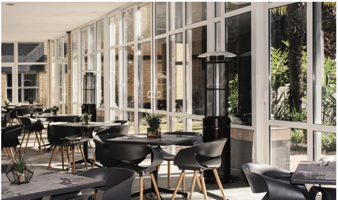
Holiday Inn OR Tambo