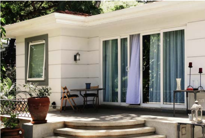
Traditional sliding door

Whether you need a patio or residential door, we have a range of doors that will thrill you. Our star: the Securi Slide & Fold door, a sliding – fold away door that is essential for every safety-concerned home owner.