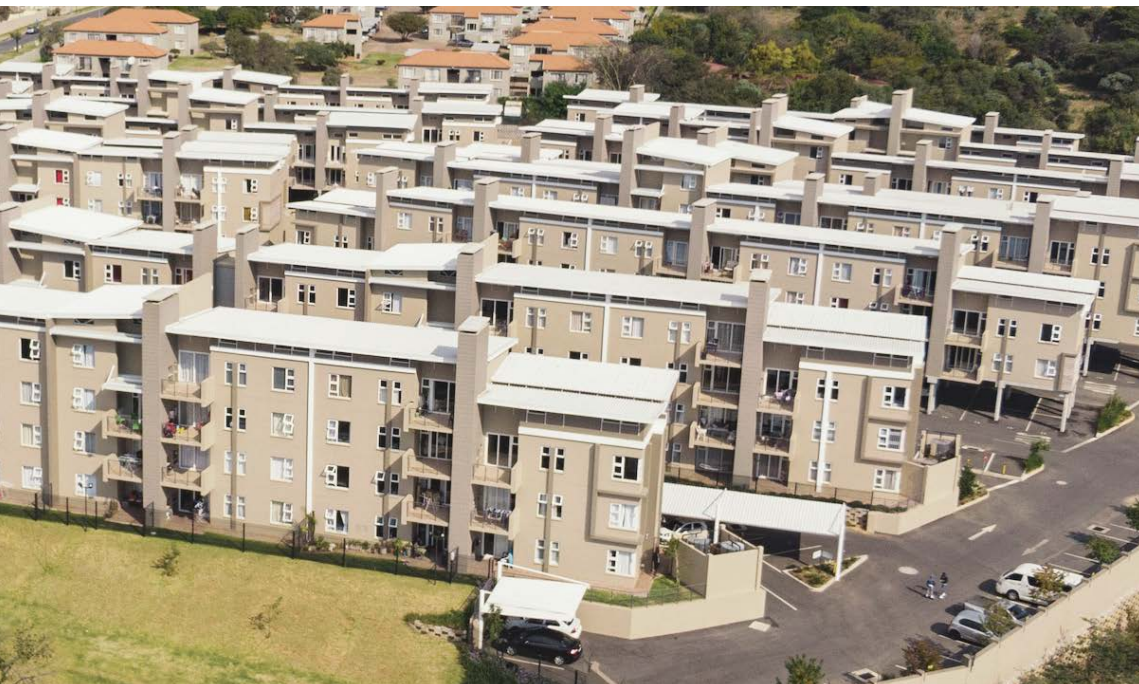
Northgate Heights, Johannesburg