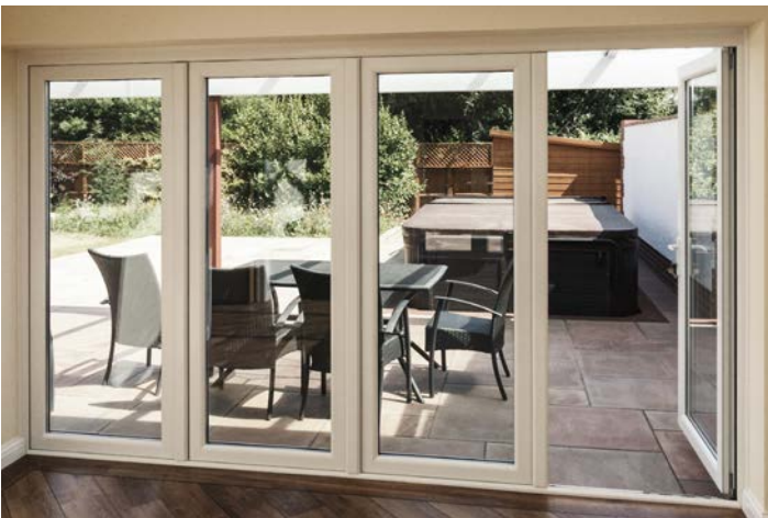
Securi Slide & Fold door