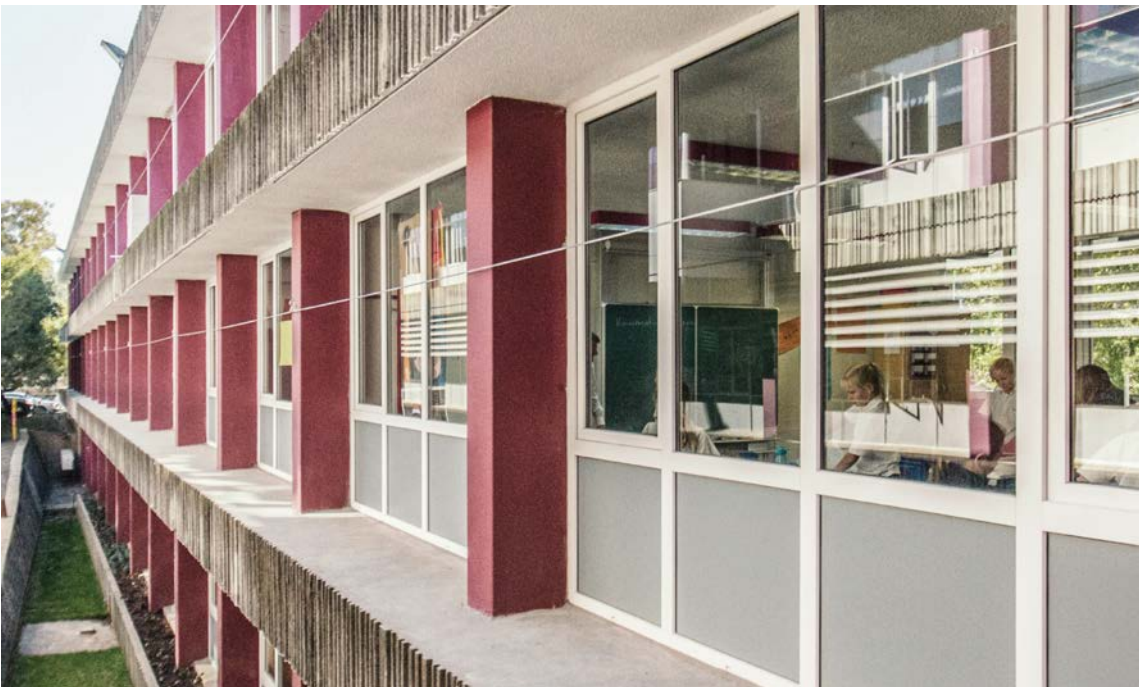
Deutsche Internationale Schule Johannesburg