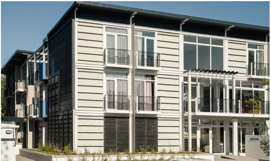
Student accommodation, Stellenbosch

REHAU's uPVC window and door systems are used throughout the whole range of commercial buildings. From schools to hospitals and housing developments, our products are preferred because of the many advantages they offer, making them an ideal choice for the Architect, Developer and Quantity Surveyor.