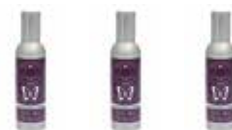
Room Spray Pictured

Use your HALF-PRICE HOST REWARDS to save even more on a Scentsy System!