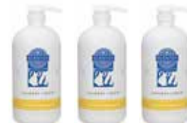
Laundry Liquid Pictured