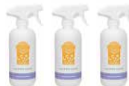
Counter Clean Pictured