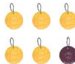
Scent Circle Pictured