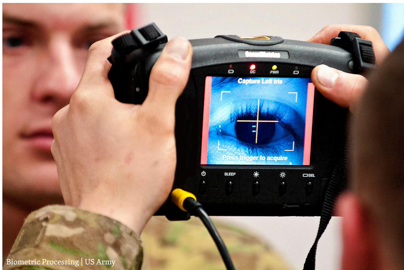
Biometric Processing | US Army