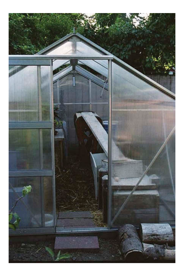
Figure 2. Sean's greenhouse doubles as a chicken coop.