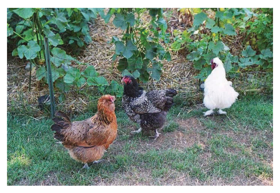
Figure 3. Hens foraging for slugs and insects alongside Sean's vegetable garden.

Enrolling chickens as pest control was not always simple, as they also scratch up and eat garden plants. NUCKs thus had to plan how to contain the chickens and move them around the garden seasonally before, after, or in between crops. This four-way challenge involving people, chickens, bugs, and garden plants—each with its own agenda—prompted NUCKs to expand their urban ecological imaginary.