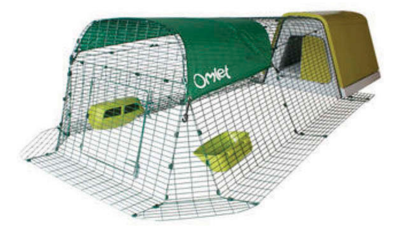
Figure 4. The "Eglu Go" coop design, manufactured by Omlet-USA.