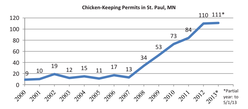
Figure 1. St. Paul, Minnesota, chicken-keeping permits issued by Animal Control, 2000–2013.

classes, beginning with "City Chickens 101" in 2002. Chicken-keeping classes are now finding new sponsors and locations, including food co-ops and urban farm supply stores, such as Egg|Plant, in Saint Paul, Minnesota.