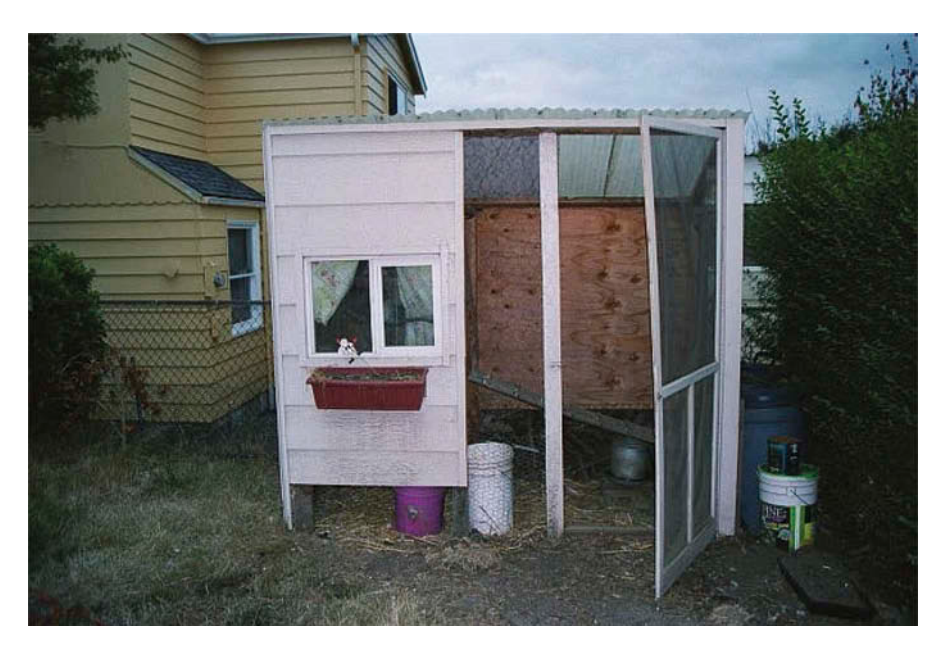
Figure 6. Sarah's coop, built mostly from found and scrap materials.