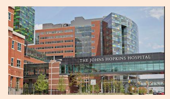
Figure 5: Johns Hopkins Medical Campus

Figure 2: Site Vicinity Map Page 3 of 11