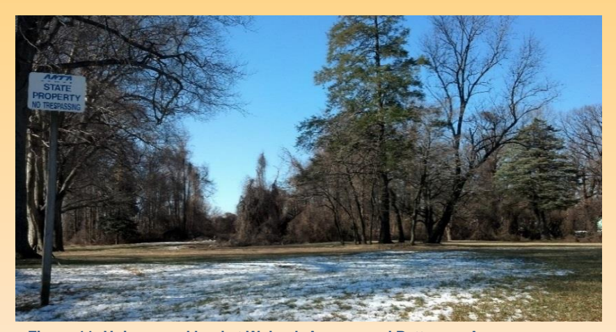
Figure 11: Unimproved land at Wabash Avenue and Patterson Avenue