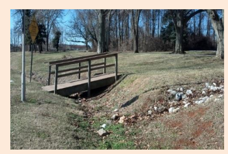
Figure 10: Typical culvert Page 6 of 11