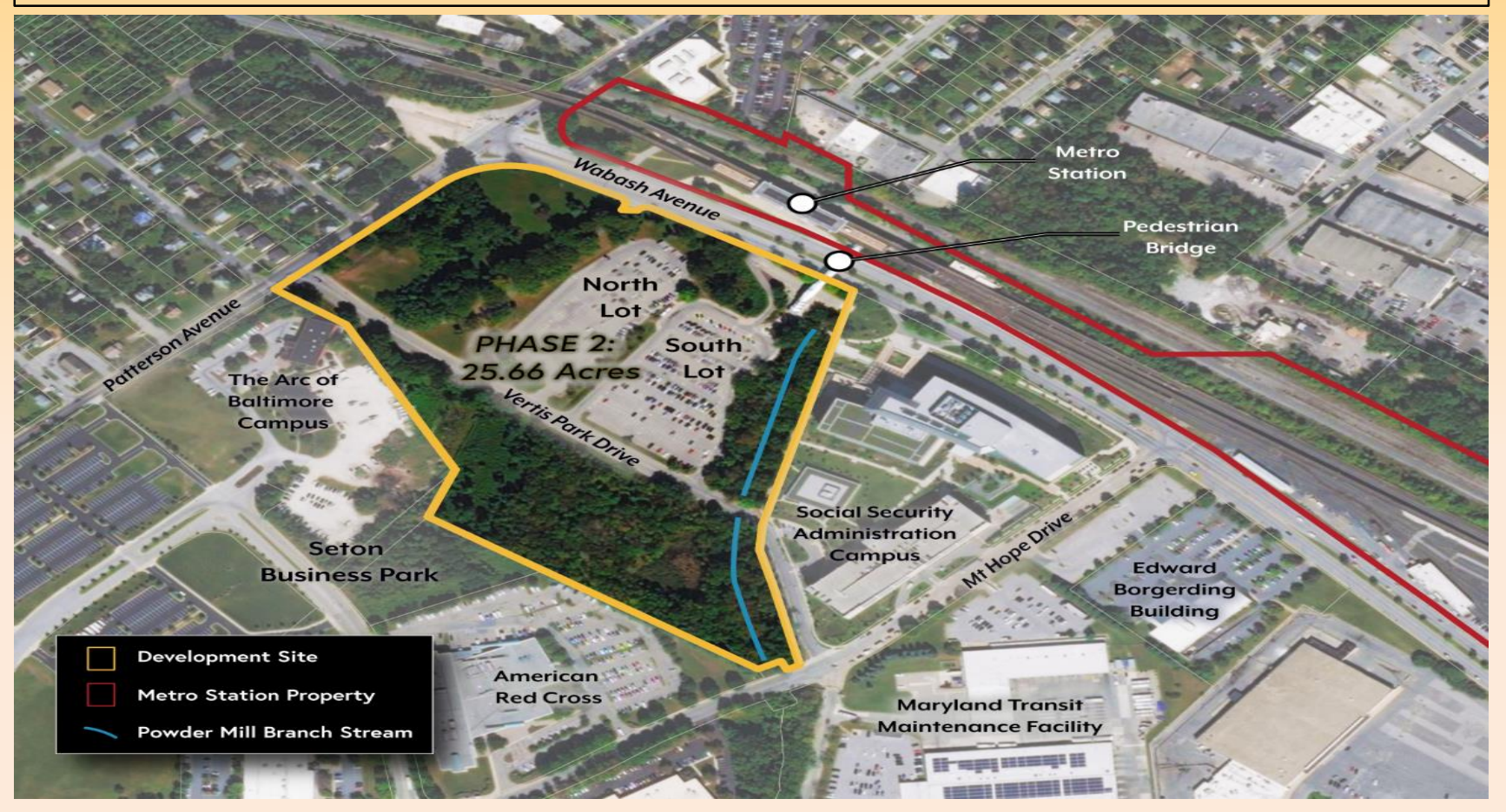
Figure 6: Reisterstown Plaza Metro Station - Phase 2 TOD Site

A Maryland Transit-Oriented Development or (TOD) is a dense, mixed-use deliberately-planned development within one-half mile of a transit station that is designed to increase and enhance transit ridership. It may include residential, office, retail and/or other amenities integrated into a walkable pedestrian friendly neighborhood. TOD should reduce auto dependency; increase transit, pedestrian and bicycle trips; foster safer station areas; offer attractive public spaces; and encourage revitalization and smart development patterns.