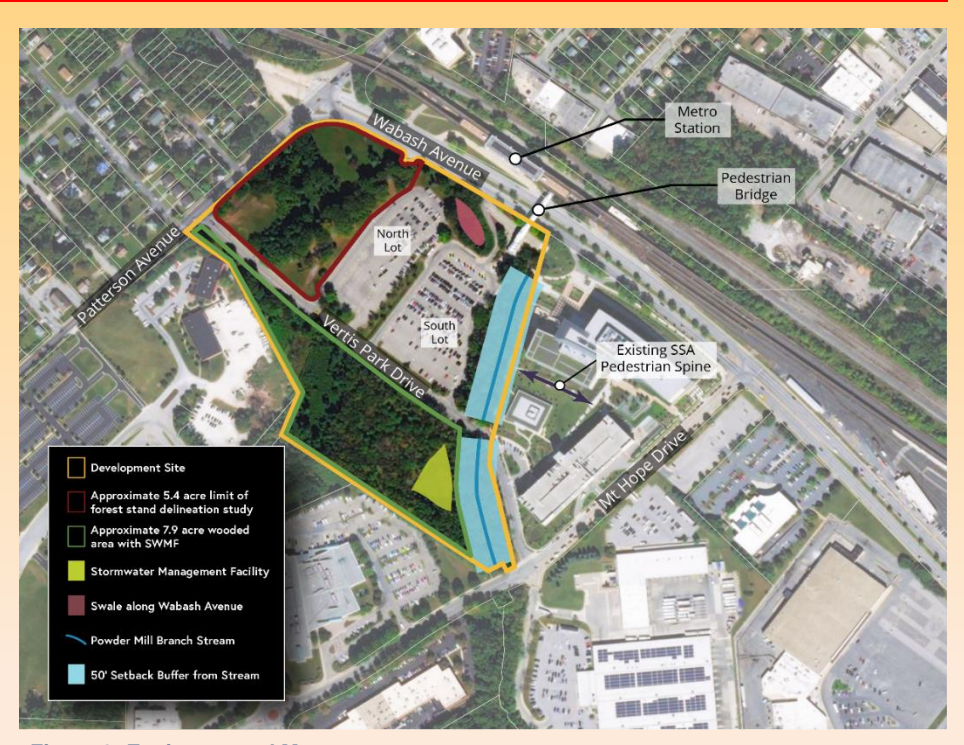
Figure 8: Environmental Map