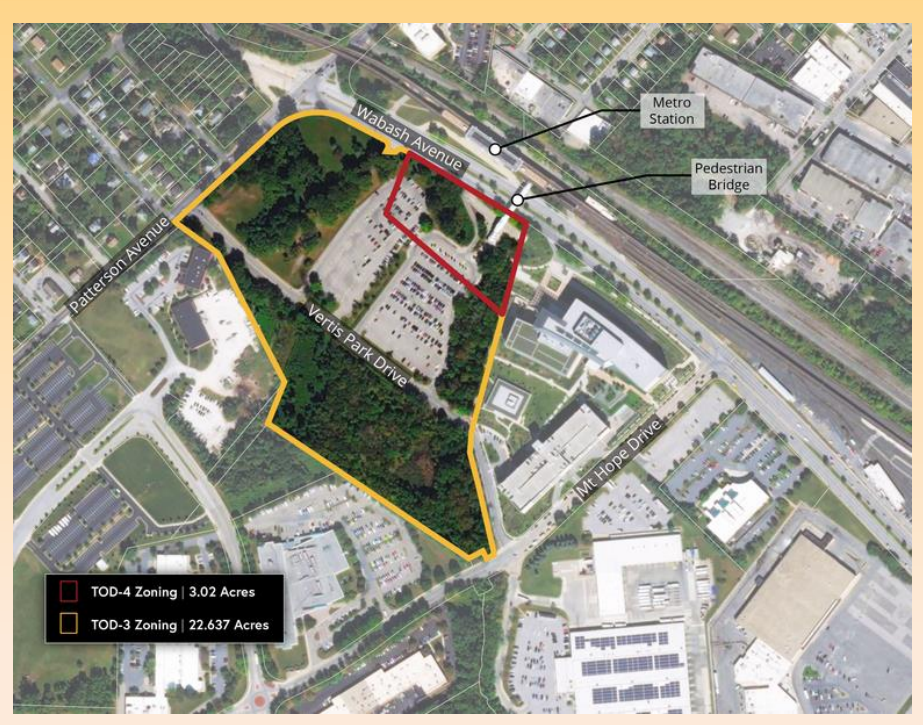
Figure 7: Zoning Map