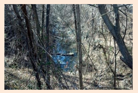
Figure 9: Powder Mill Branch Stream