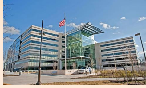
Figure 13: Social Security Administration Building