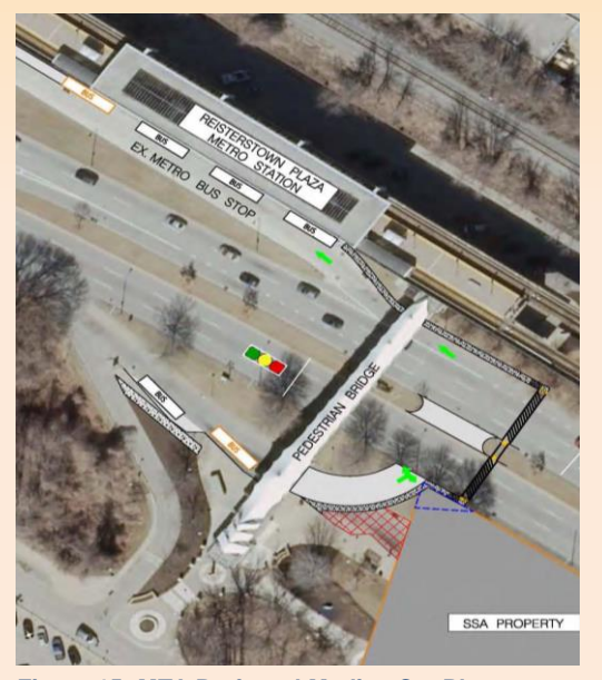
Figure 15: MTA Preferred Median Cut Plan