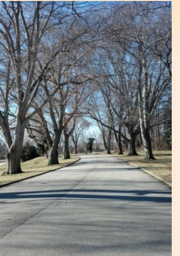
Figure 12: Specimen trees form an allee