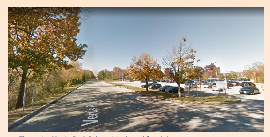
Figure 17: Vertis Park Drive with view of South Lot