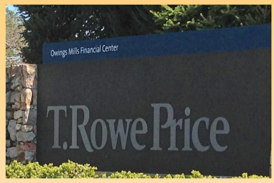
Figure 3: Owings Mills Financial Center