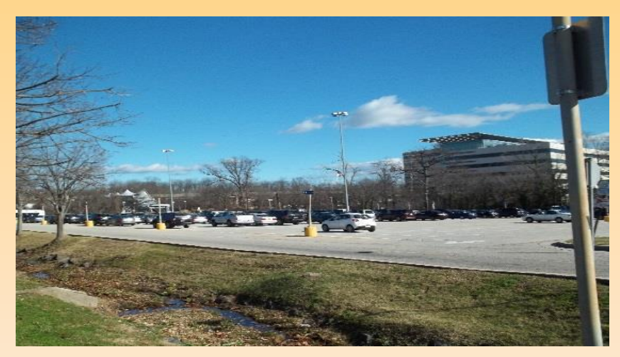
Figure 16: South Lot with view of the Social Security Administration Building