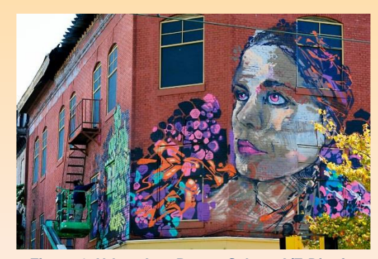
Figure 4: Urban Art - Bromo Seltzer A/E District