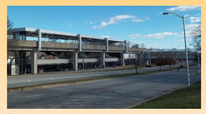
Figure 14: Reisterstown Plaza Metro Station-east side of Wabash Avenue