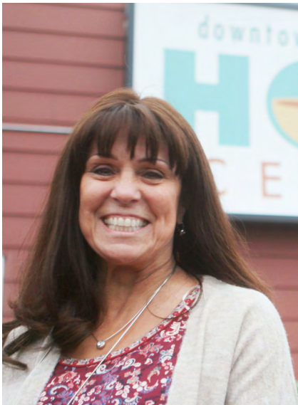
Downtown Hope Center v. Municipality of Anchorage, et al.

Advocating for the rights of people to freely live out their faith.