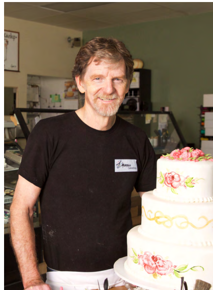
Masterpiece Cakeshop v. Colorado Civil Rights Commission