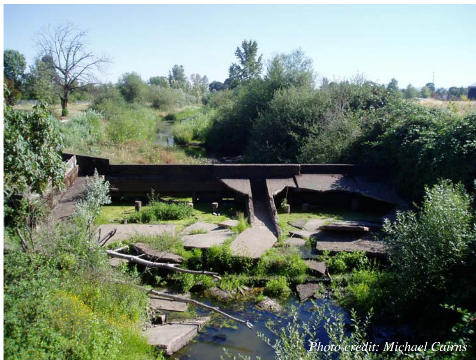
Figure 7. South Fork Ash Creek, Mount Fir Mill Dam, Luckiamute Watershed

Appendix C shows a decision checklist the Brownsville Dam project used to assist their interview committee in deciding which firms to interview. Appendix D is the information the project provided to the top three candidates prior to their interviews so they would come to the interview prepared. Appendix E is the questions and decisions matrix used by the interview committee during the interviews to assist in making their decision.