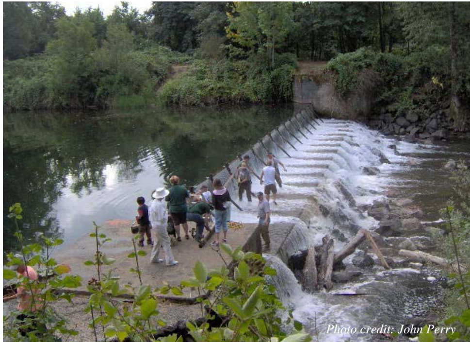
Figure 1. Removing the flashboards from Brownsville Dam, August, 2007.