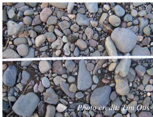
Figure 12. Sediment stored behind Brownsville Dam