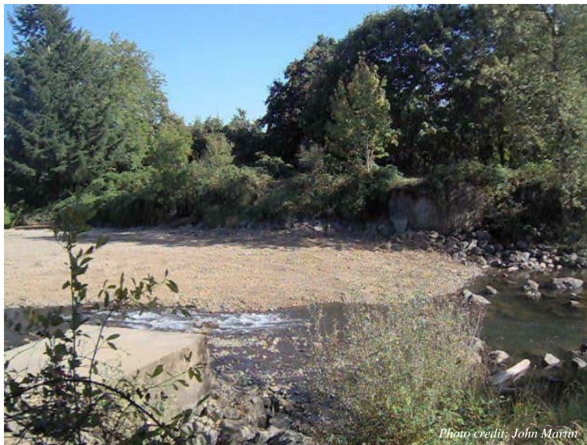
Figure 18. Calapooia River, September 2007 immediately following dam removal.

You may decide to have a final site tour following the project's completion. Members of your technical team and local community may want to hear about the removal process (how many tons of concrete were removed, what fish were found during de-watering, etc.) and want to view the site in its new condition. This is also a good time to reflect on the project and lessons learned and glean any insights that may help ease the way for future dam removal projects. Should you remove a dam in your watershed, send your lessons learned to hofferthay@peak.org . This guide will be updated periodically at which time your lessons learned can be included.