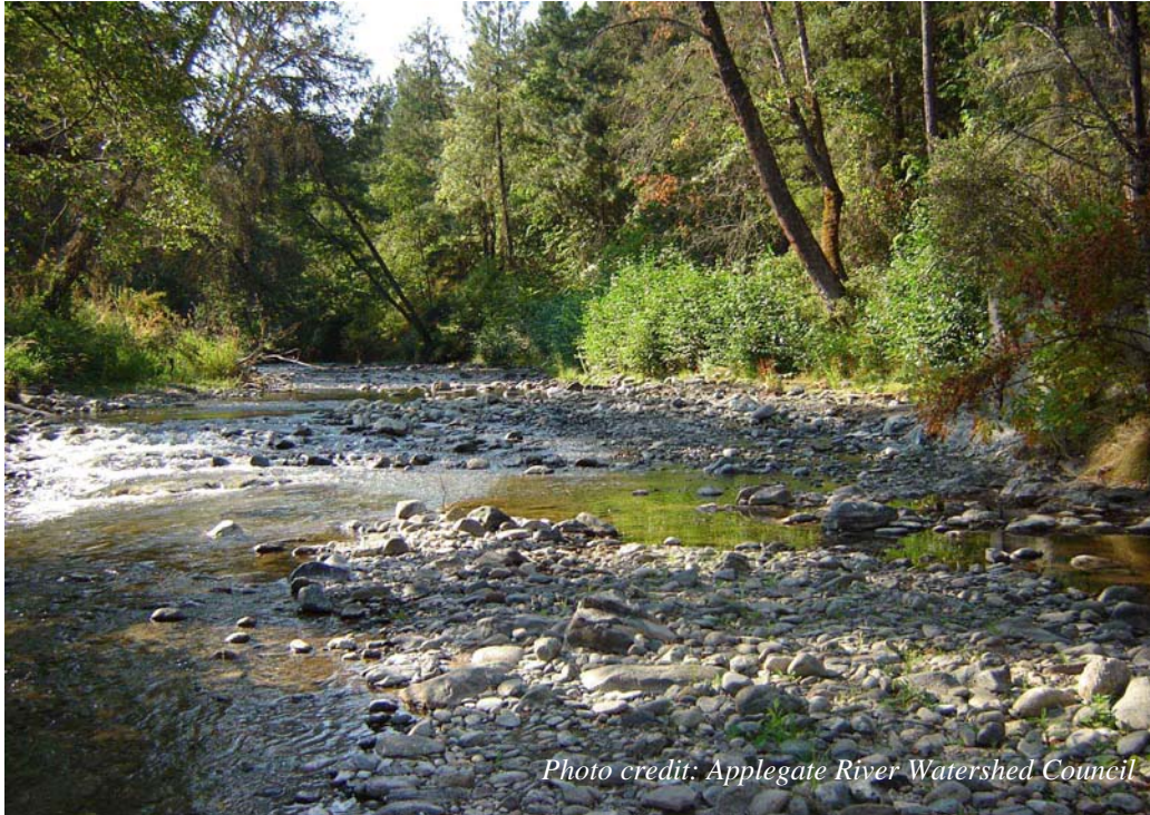
Figure 16. Applegate River tributary following removal of Buck and Jones Dam in 2006