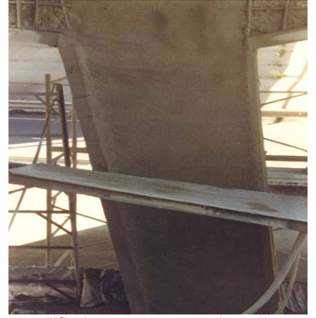
Prequalified contractors and quality inspection can produce excellent repairs.