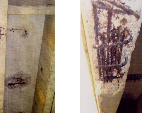
Corrosion damage to prestressed strands affects girder capacity. Investigate corrosion spall cracks to assess the extent of corrosion damage.

Concrete surfaces are to be finished to Class 2 rubbed finish and a matching pigmented sealer is to be applied to match existing finishes on exterior girders. Interior surfaces to receive an application of concrete sealer.