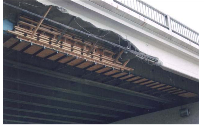
Damaged portions of girders shall be recast to restore the original lines. Forming shall be new plywood materials such as "Coated Formply" Evans 107, or approved equivalent – or steel forms.

Damaged strands shall be spliced and re-stressed to initial design tension of 128.5 kN. Splices shall be staggered to avoid congestion.