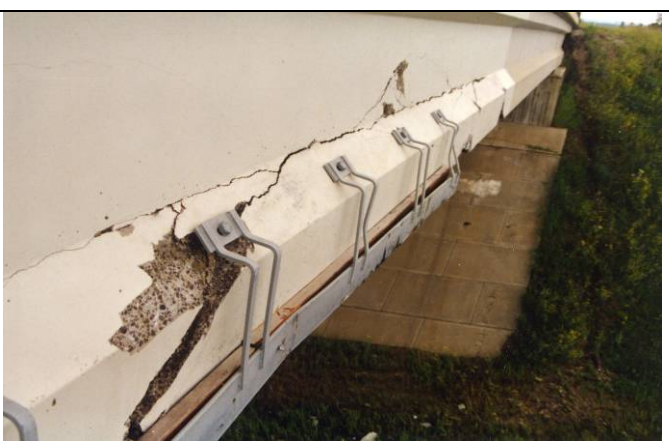
Fractured / displaced concrete sections need to be recast to original girder sections.