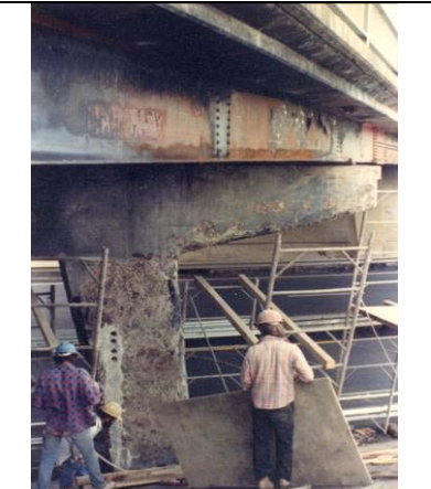
Rebound hammer and core testing is performed to determine the extent of fire damage.