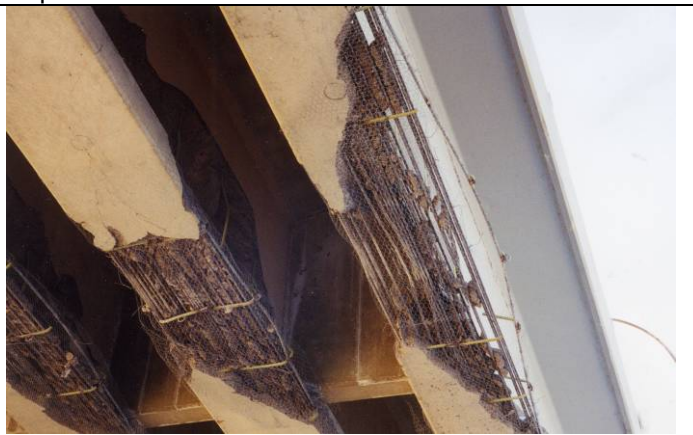
Netting may need to be installed to ensure that loosened concrete fragments do not fall onto the roadway below.