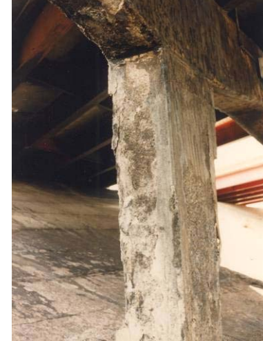
Delamination sounding may be required on concrete elements. Hardness testing will aid to determine the extent of severe damage.