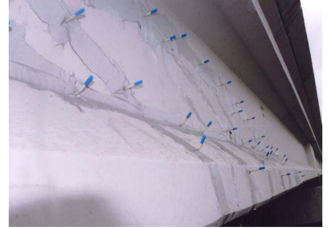
Cracks shall be temporarily sealed and injection ports installed – spacing of the ports shall be maximum 150mm.