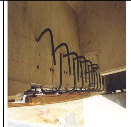
Corrosion repairs to strands may be addressed by external post tensioning. Above, corbel block.