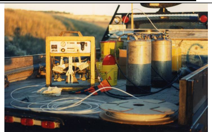
Epoxy resin pressure injection pump and component injection tanks.