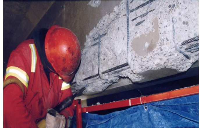
Loose, delaminated concrete shall be removed using small tools – care exercised to ensure that prestressing strands are not damaged.