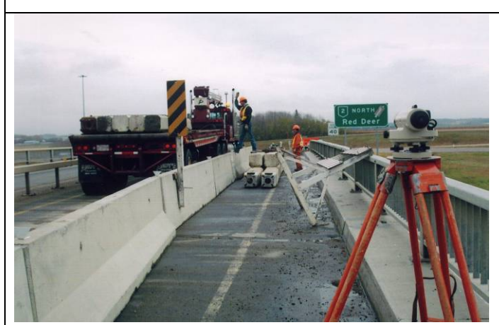
Damaged girders shall be preloaded to open cracks and create compression in replacement concrete after unloading.