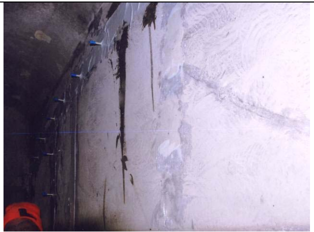
Following curing of the epoxy resin, ports and crack sealant shall be completely removed.