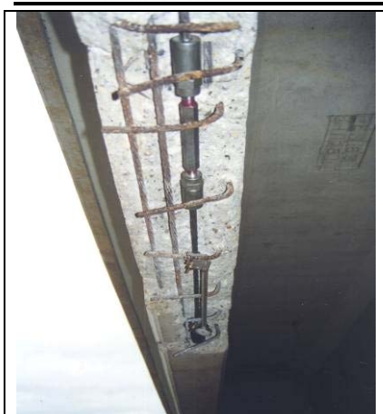
Strand corrosion damage restored. Determine the extent of damage, splice and tension strands.