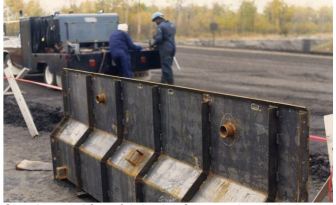
Showing steel form fabrication for recasting girder leg section.