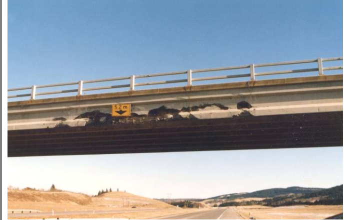
High load damage assessment needs to identify the full extent of damages. Barricades may be required to direct traffic from damaged areas. Load restrictions may be required.