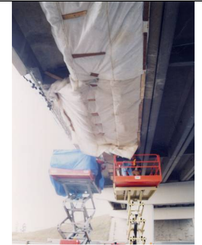
Suitable heating and hoarding are required.

During cold weather, forms must be insulated.