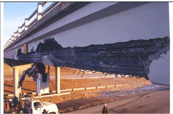
Loose fractured concrete needs to be removed from girder sections and concrete rubble needs to be removed from the roadway.