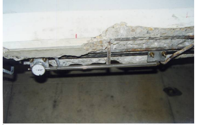
Strand repair tension loads are applied to initial design values using dial gauges and devices to monitor elongations at accuracy of 1/1000 of an inch or 0.100".