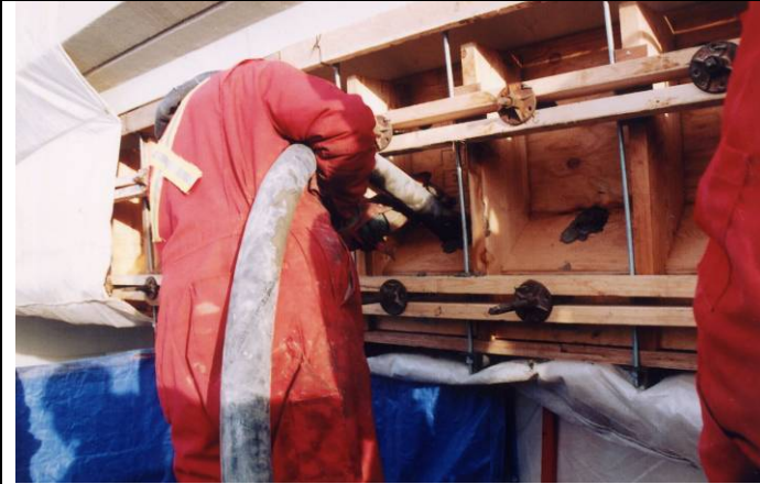
Pumping concrete into plywood formed leg section. Spacing of pour access holes shall not exceed 600mm.