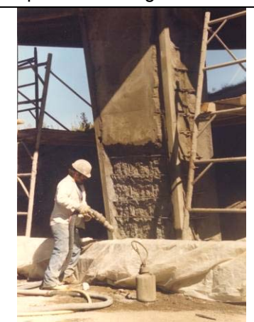
Shotcrete repairs performed to restore the pier shaft.