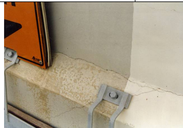
Cracks in concrete sections ≥0.3 mm shall be full depth pressure injected with approved epoxy resins.