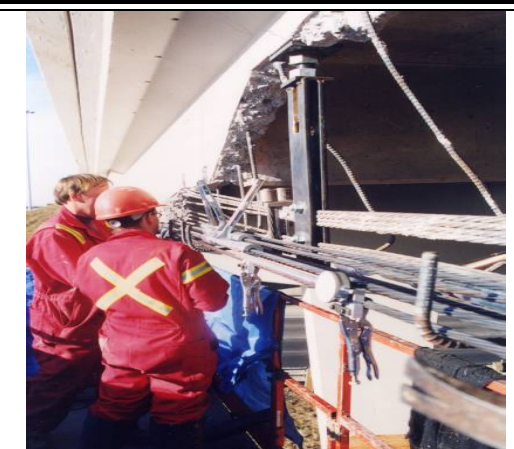
Displaced deflected strands must be positioned according to design details. Modified deflection brackets may be required to achieve design attributes.