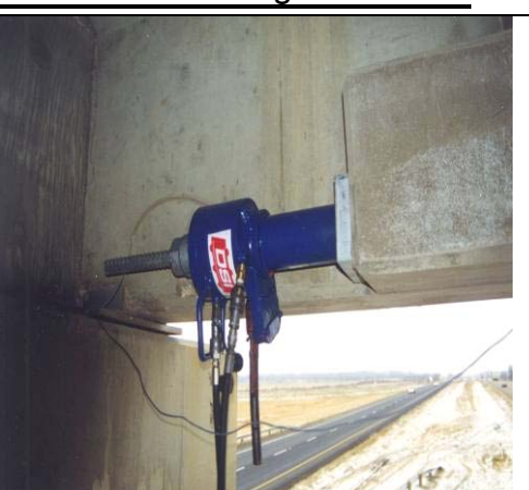
External, galvanized Dywidag bars are post tensioned – strand corrosion repair.