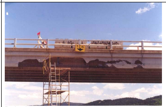
Preload mass is set centered over the damaged girder sections. Fractured and spalled sections of concrete are removed.