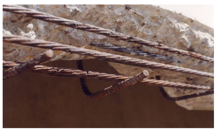
The effects of corrosion damage can result in loss of prestressing forces.