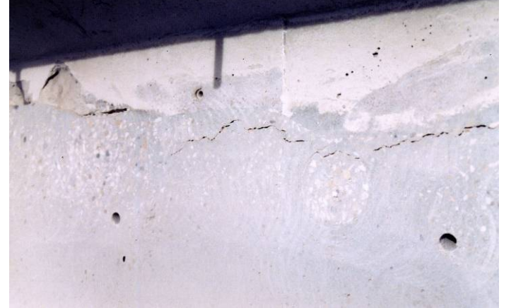
Pour / cast perimeter lines shall be full depth pressure injected with epoxy resins.