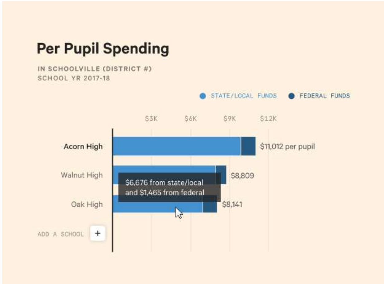
Figure 3 displays stacked bar charts showing per-pupil expenditures by funding source for schools in a LEA. Tooltips ( i.e. , information that appears when you hover a cursor over a bar) demonstrate how to reveal additional information for each data point. An “Add a School” button makes it simple for a user to add more schools to the visualization.