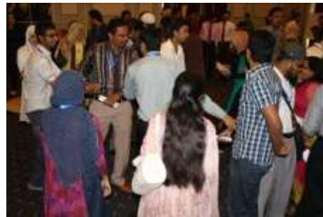
Find a Member by Voice of an Animal