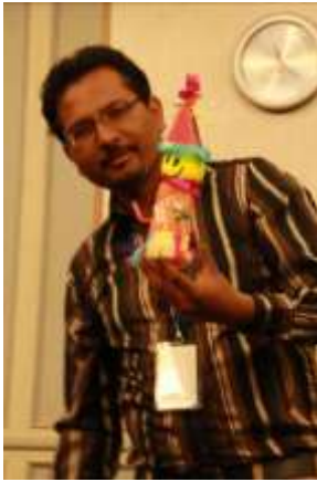
Result of Group Activities