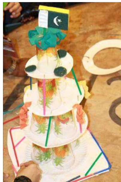
Result of Group Activities