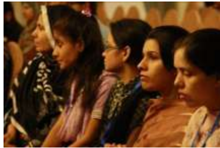
Female Visually Impaired Participants