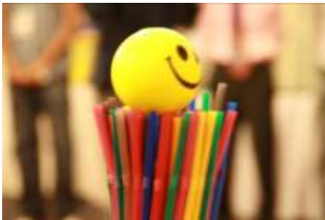
Material Use for Group Activities