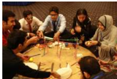
Sighted and Blind Group Members at work