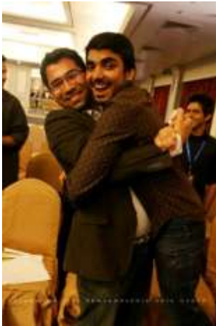
Participant Hugging Each other as part of the Activity