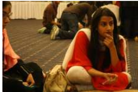
Listening and Sharing Ideas