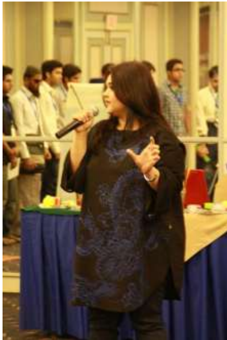
Blind and Sighted Participant