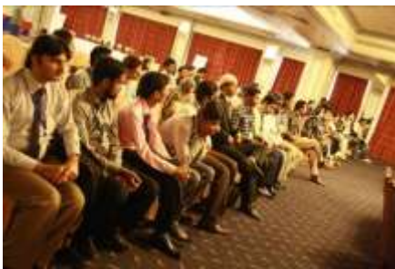
Male Visually Impaired Participants