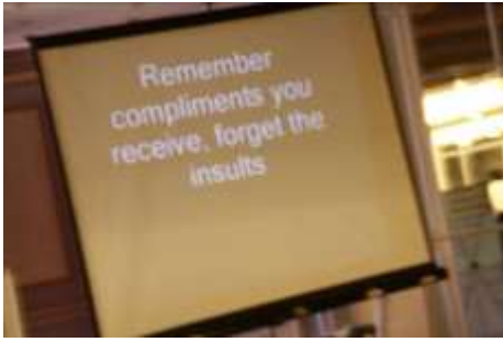
Session Presentation Slide