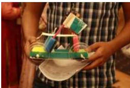
Result of Group Activities