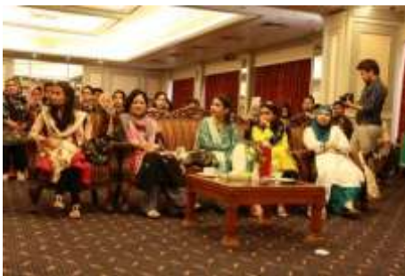
ECDI Team (In front row)