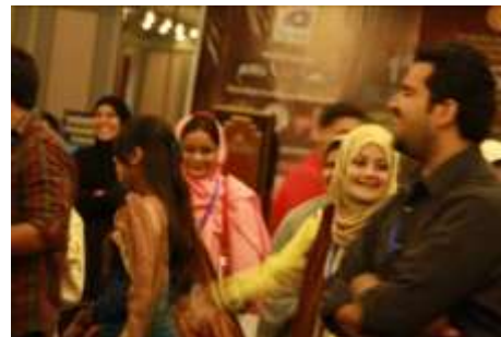
Finding the Group Partner