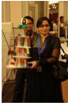
Result of Group Activities