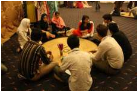
Participant in Group