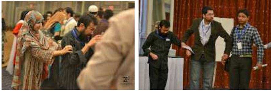
Visually Impaired and Sighted Participants together at Activities