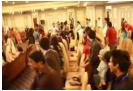
Activity during the session