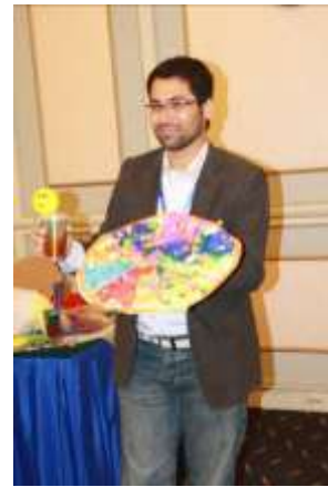
Result of Group Activities