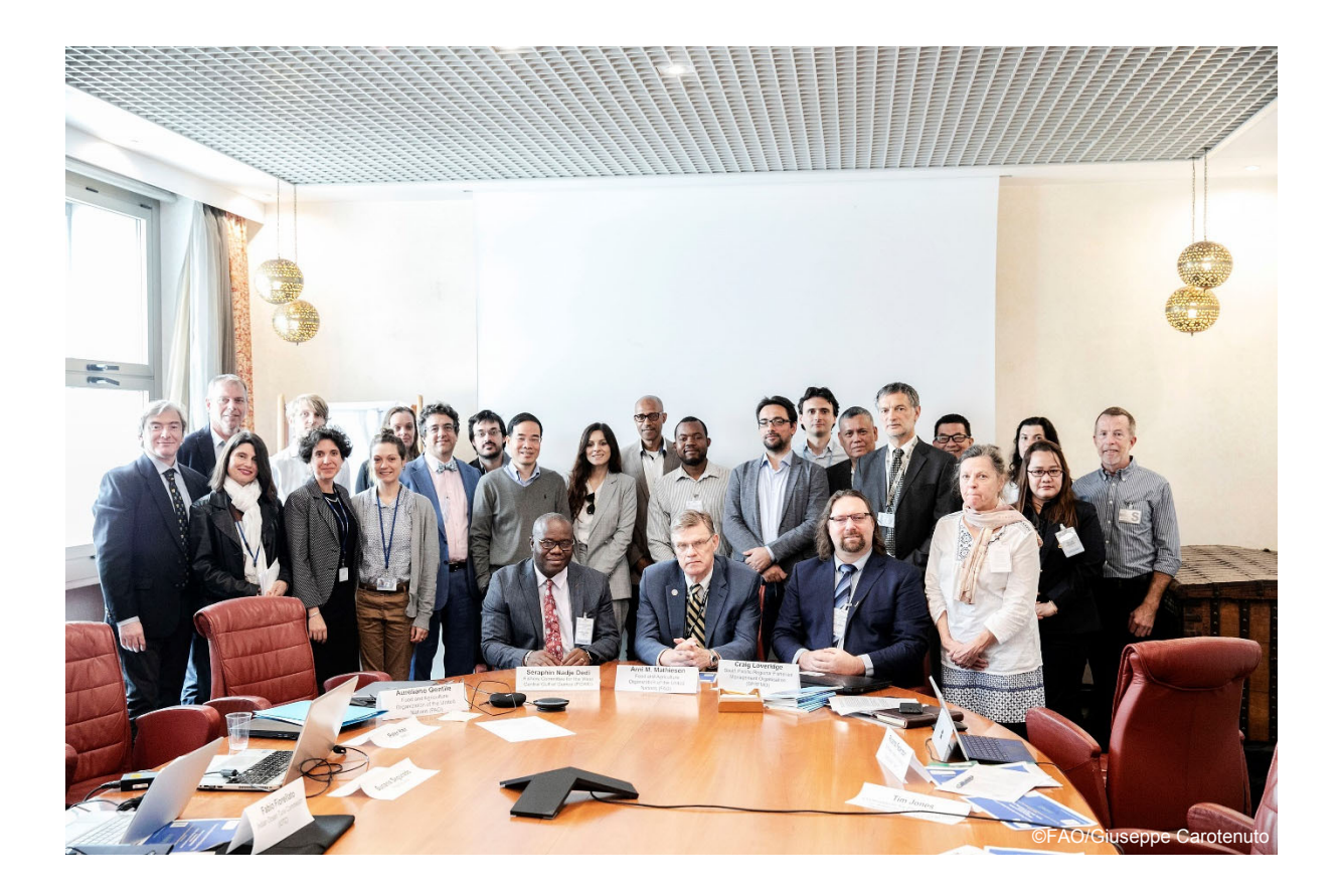
Annex 9 FIRMS FSC11 group photograph