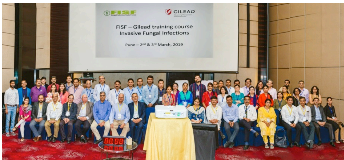
Clinical training course at Pune, India

invasive and allergic fungal diseases. This e-course has been running successfully for the last three years with the education grant from Pfizer, India.