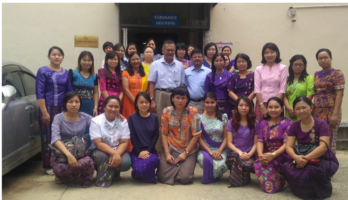
Training course at Yangon, Myanmar

In addition, a short-term training program for 1-3 months is also available for the people of southeast member countries under SEARO. The center also conducted training in Myanmar, Thailand and Nepal in last two years.