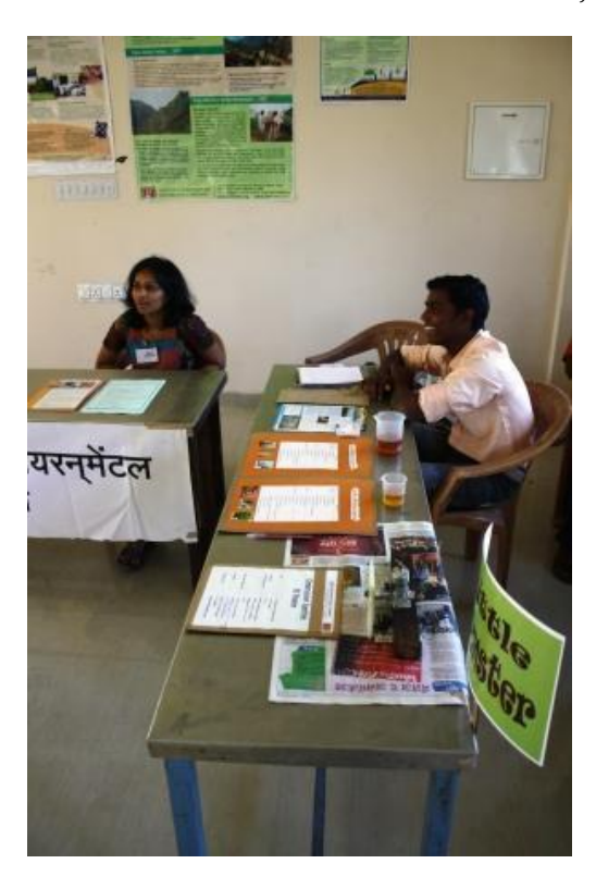
Karanj and Mahua oil Samples with description