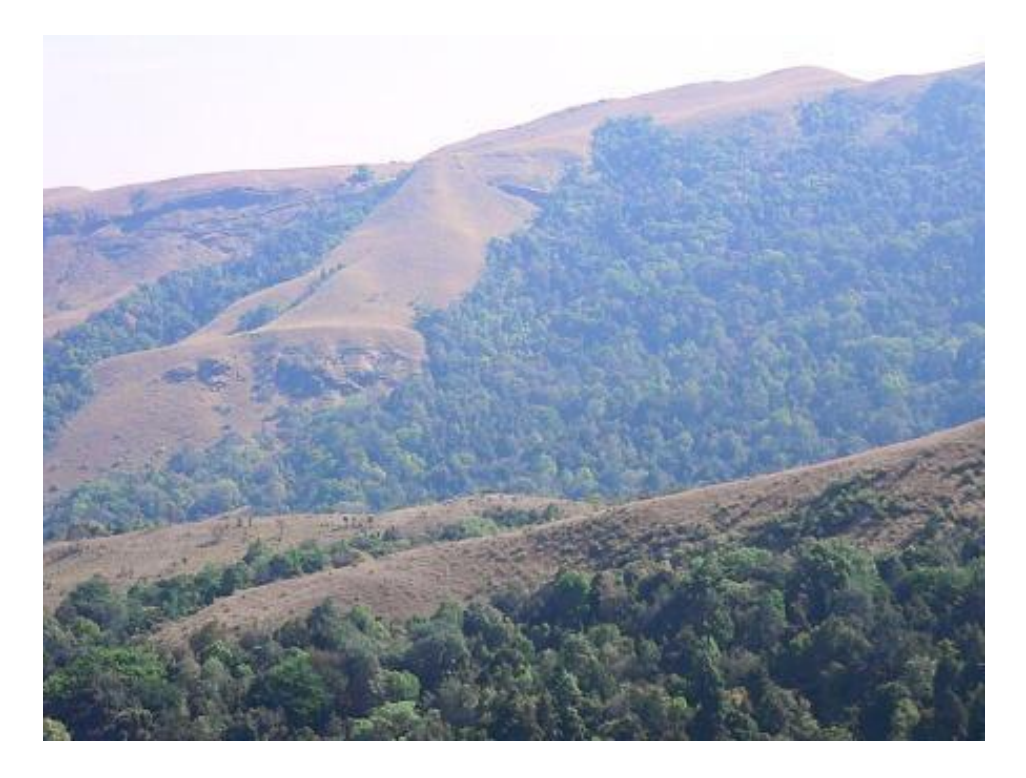
Shola Forest of Kudremukh National Park