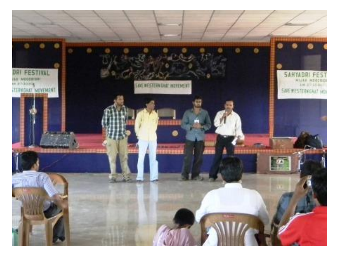
AERF team presenting findings of discussion