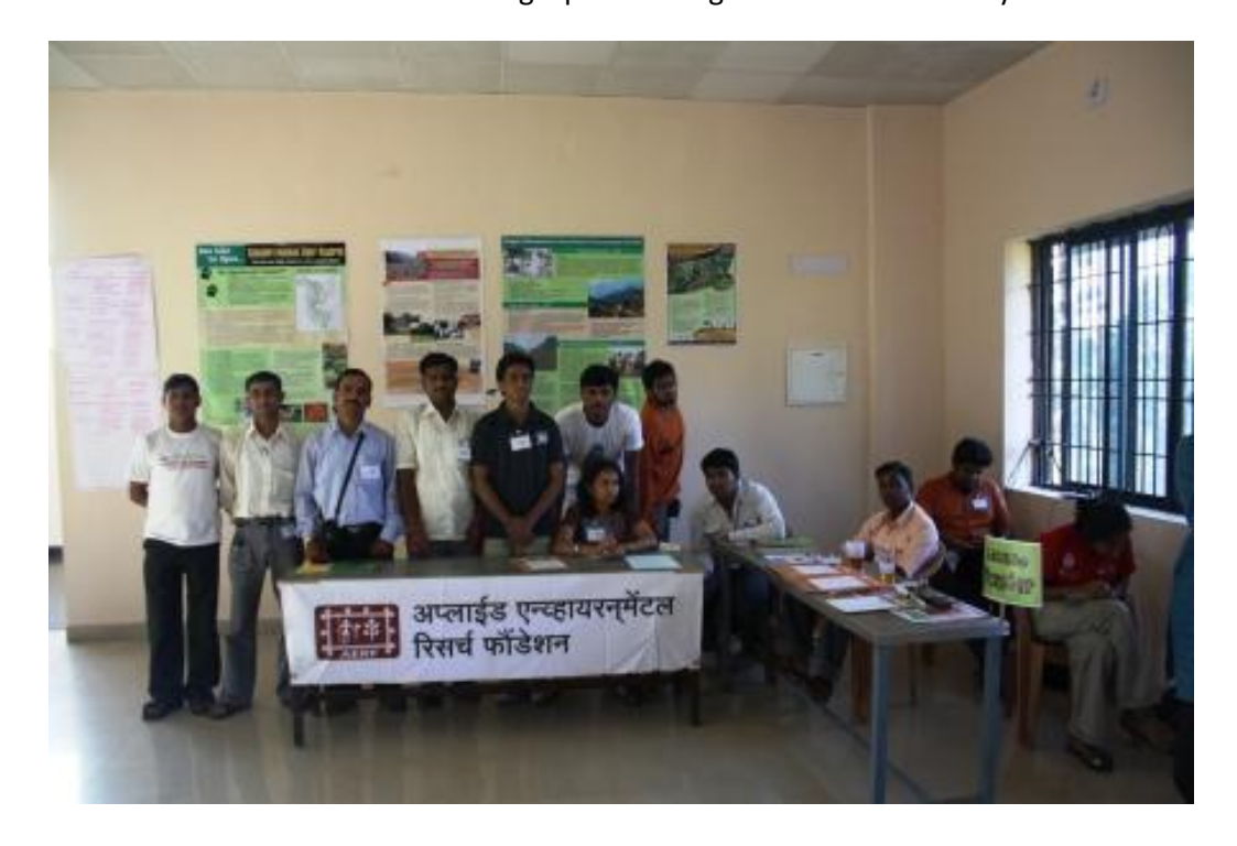
Stall of Team AERF