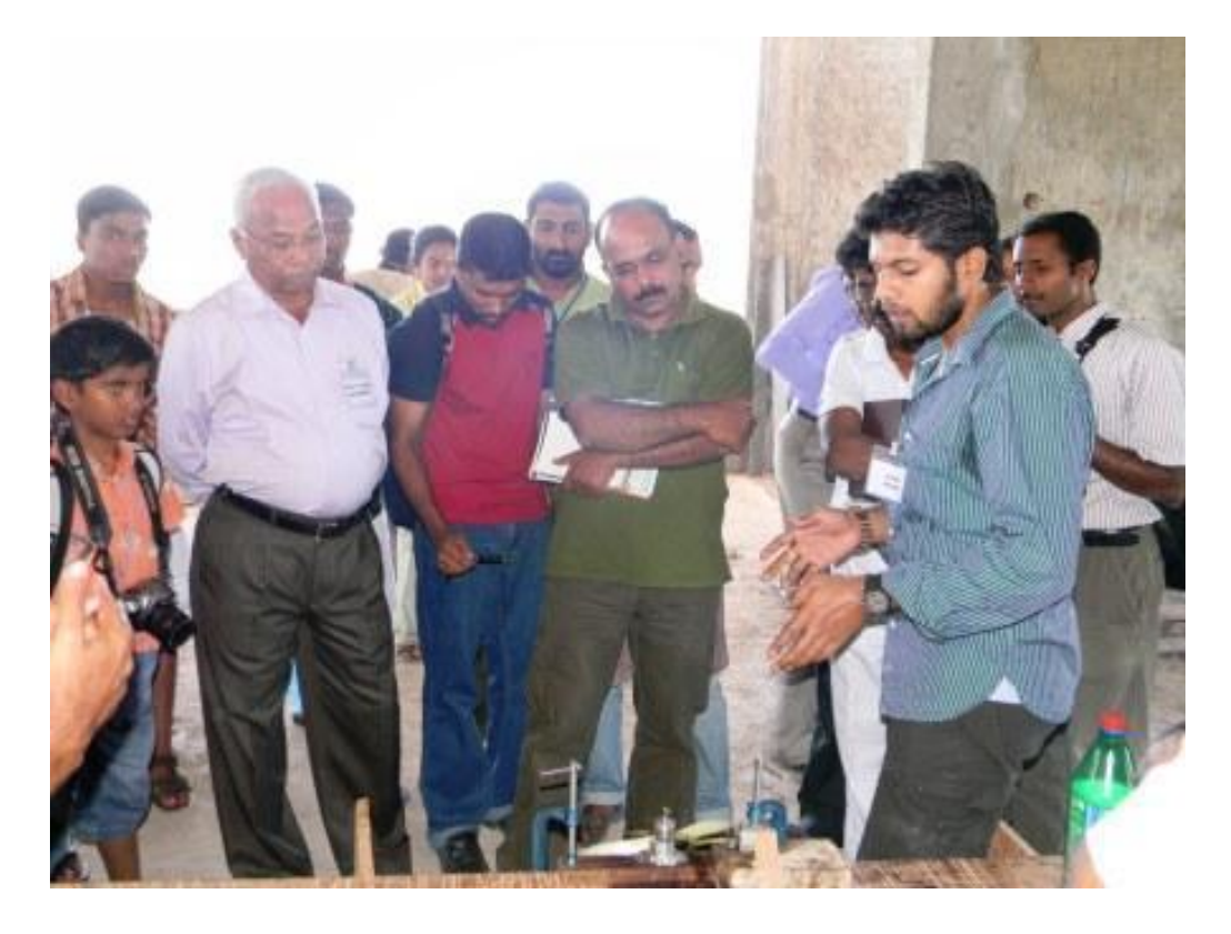
AERF team giving a Demonstration of the Engine