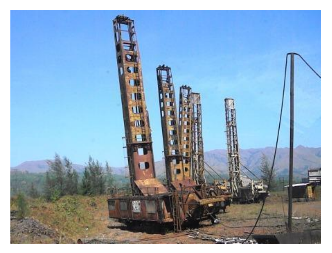
Weapons of destruction