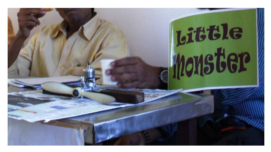
Model Diesel engine used for demonstration of SVO of Karanj and Mahua as a Fuel