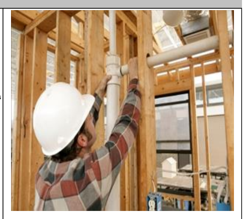
Need to use gloves when handling adhesives