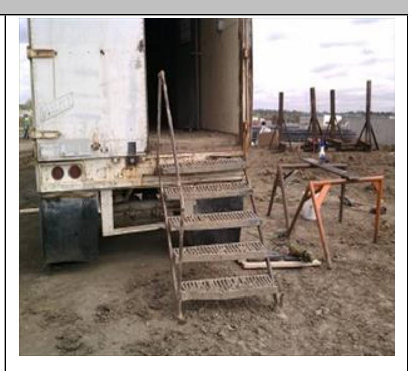
These stairs need to be repaired or replaced!

Notes: Stairs to storage trailer need to be repaired, add hand rail on right side. Responsible Party: Glidden LLC