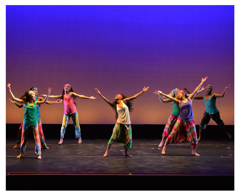
The Performing Arts Department hosted the first dance concert to be held in the configurable University Hall Theatre this spring.