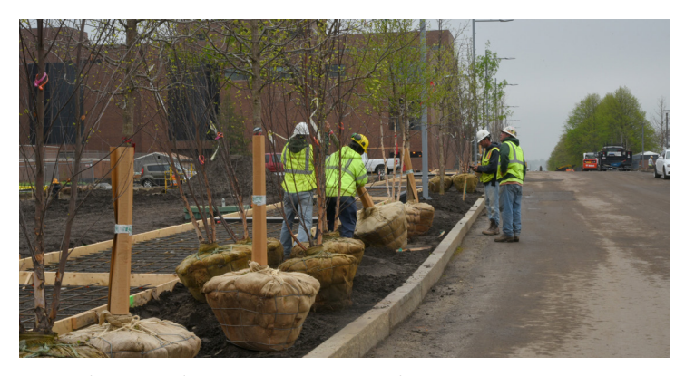
Crews plant trees along University Drive South.

Pinnacle Award winners must meet several criteria, including offering services such as emergency ride-home programs, flexible work schedules for employees, vanpools, discounted transit passes, and ride-matching services like NuRide. The university's green transit options and incentives include eco-friendly free shuttle buses, the Hubway bike sharing program, the HarborWalk, and motorbike parking.