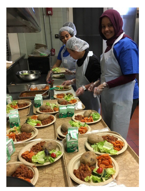
As part of Beacon Voyages for Service, students served in shelters and pantries, hearing first-hand from people struggling with hunger and/or homelessness.