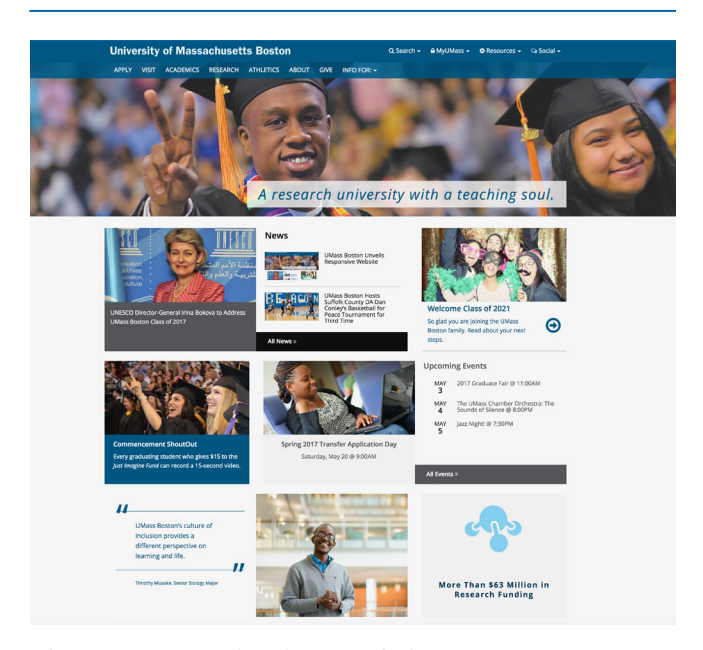
The UMass Boston website has a new look.